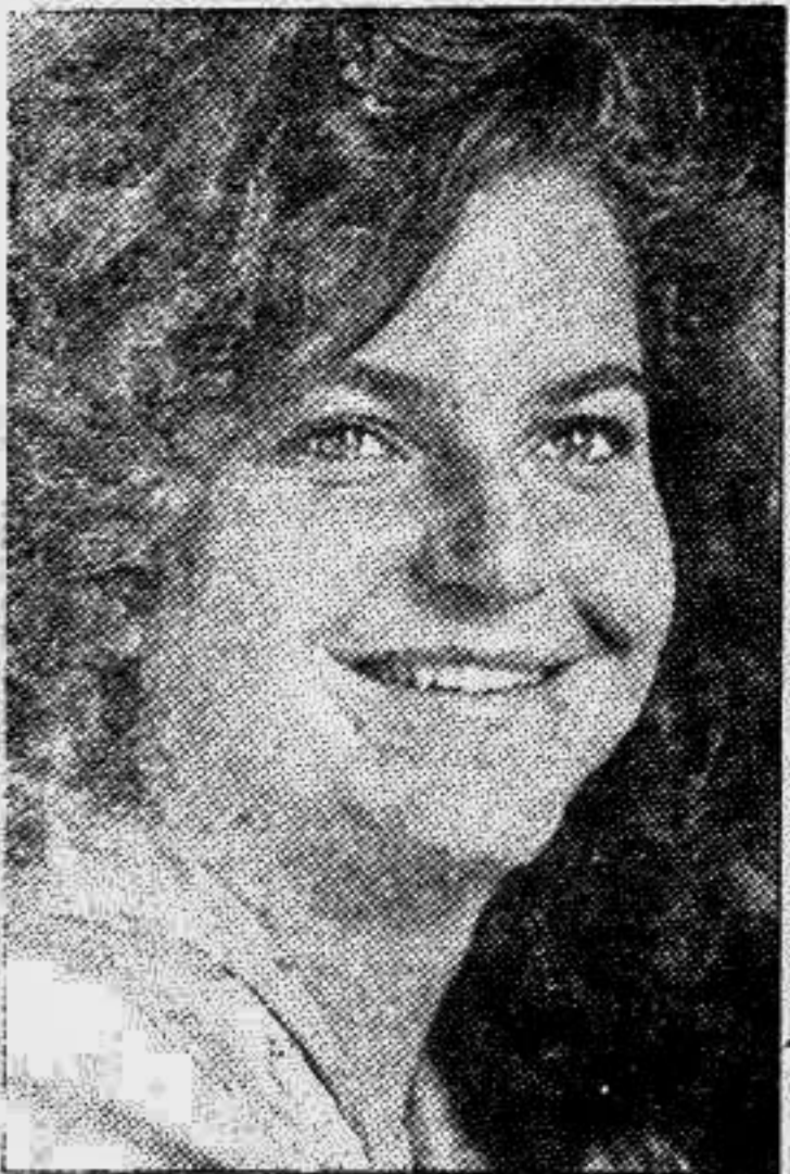
Arantxa Sanchez-Vicario (Spanish tennis star) "Champion" When asked to describe Steffi Graf.

Boost sports WHIZZ KID COMPETITION FOR SCHOOL CHILDREN Competition-120 Tick the Correct Answers Post to The Daily Star Win attractive prizes Competition closes at 8 pm Sept 24, 99 and draw shortly afterwards