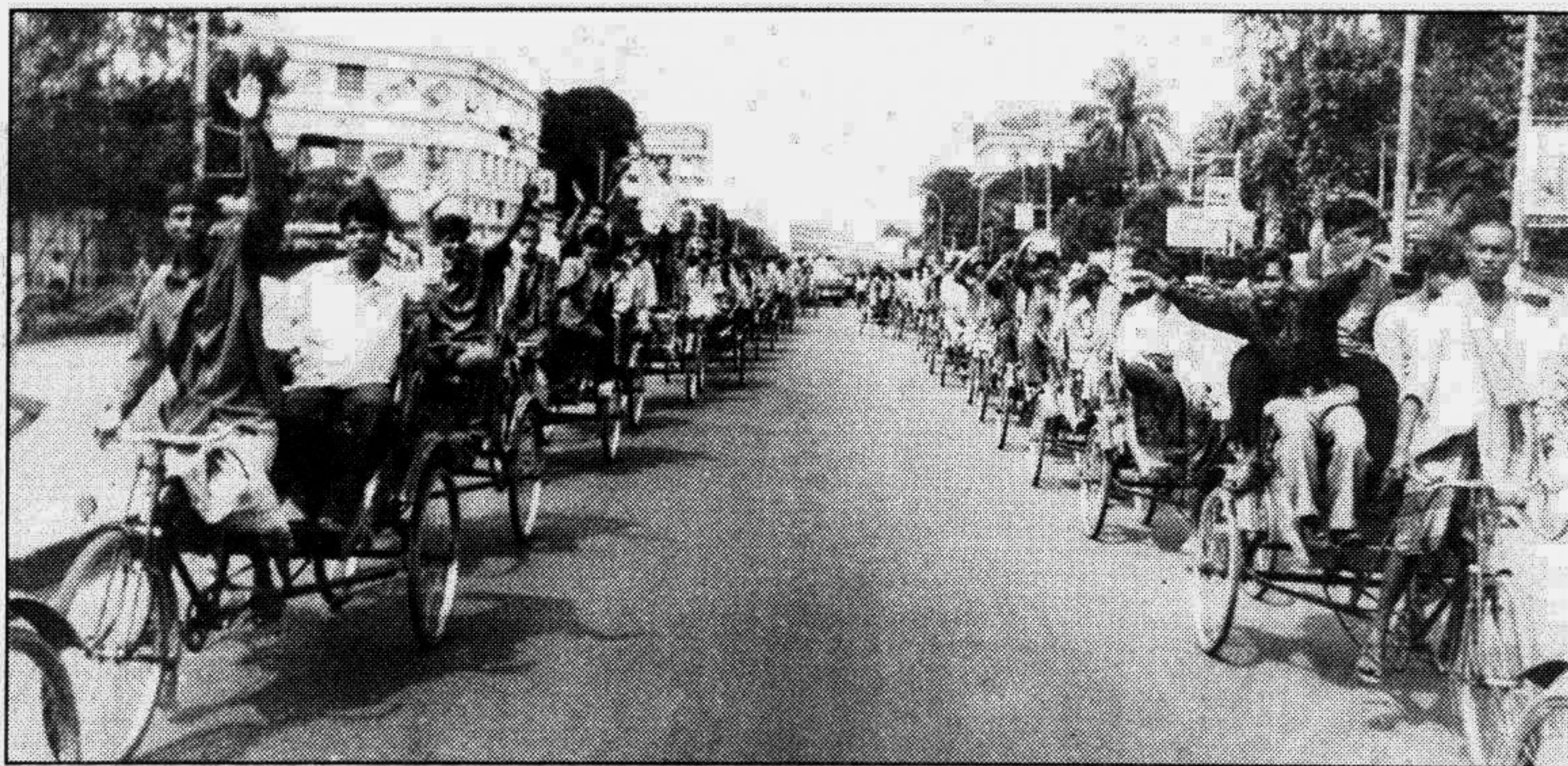
Anti-hartal activists this time opted for a rickshaw rally. There was another difference yesterday. Motor rallies during previous hartals were organised and led by the ruling party's city MPs, but none of them of that stature were seen on the volatile streets dominated by hyperactive law-enforcers.