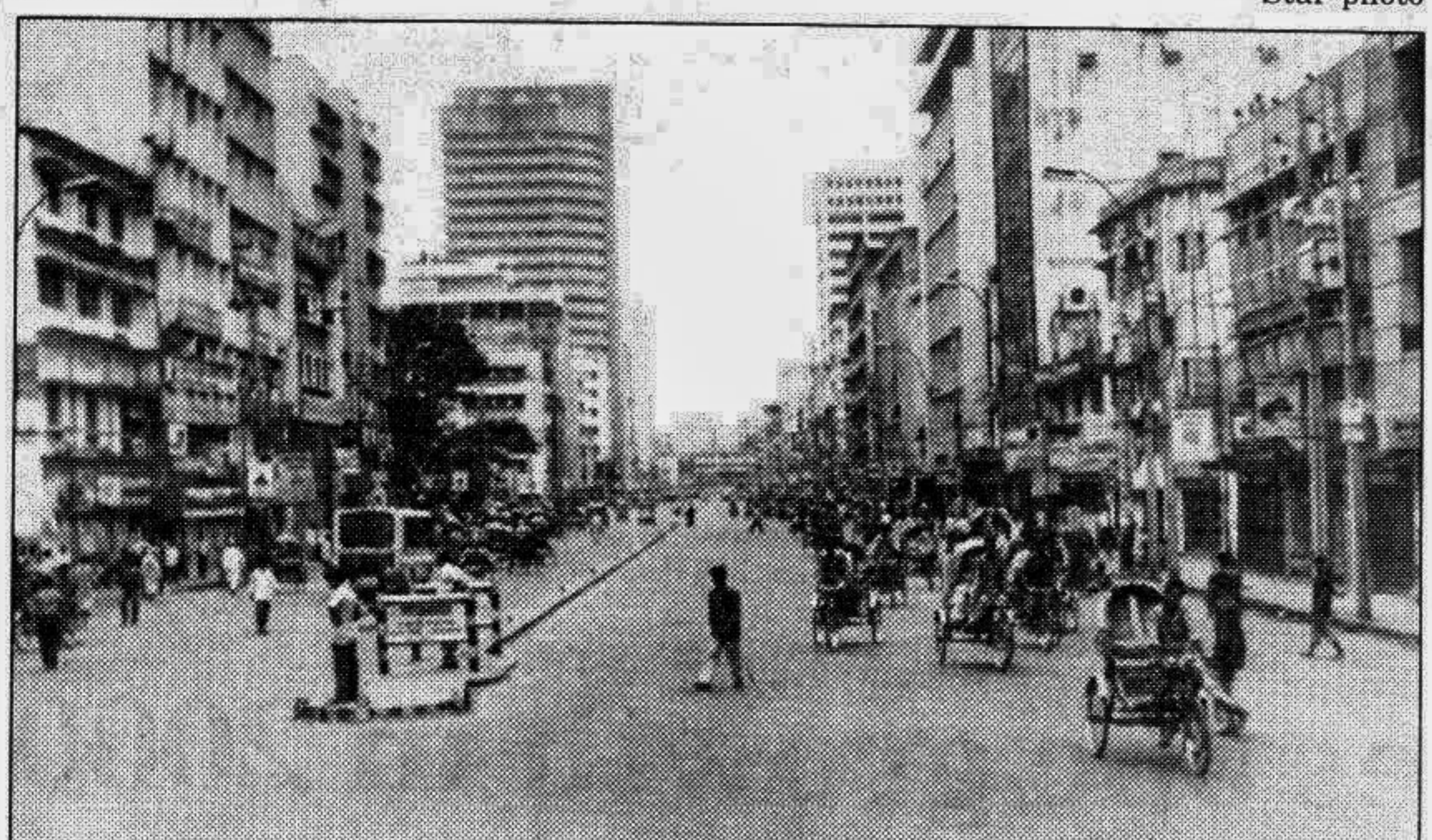
Rickshaws plied on many streets of the city during the 2nd day of hartal yesterday. This picture was taken from Motijheel area.