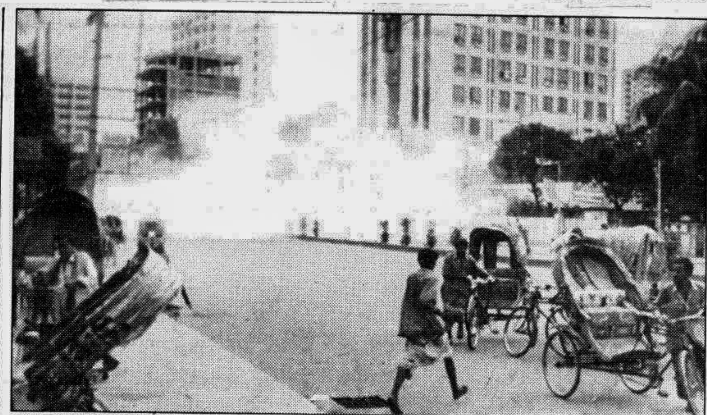
Sporadic clashes and cracker blasts marked the second day of hartal in city's Naya Paltan area yesterday.

Classes and academic activities of Dhaka University could not be held for the second consecutive day yesterday due to the 60-hour countrywide shutdown sponsored by the opposition alliance.