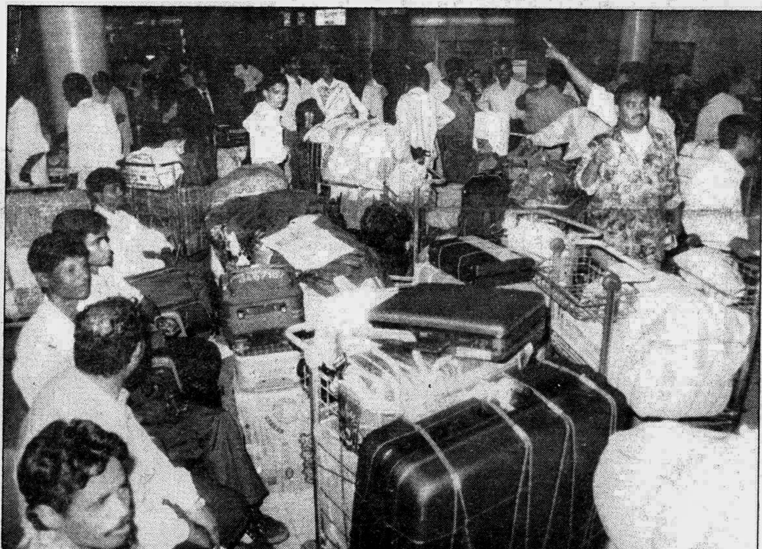
Hartal victims They arrived home, yet couldn't be home. There were about 1500 of them, coming from different parts of the world yesterday, who found themselves camped all day at the arrival lounge of ZIA.