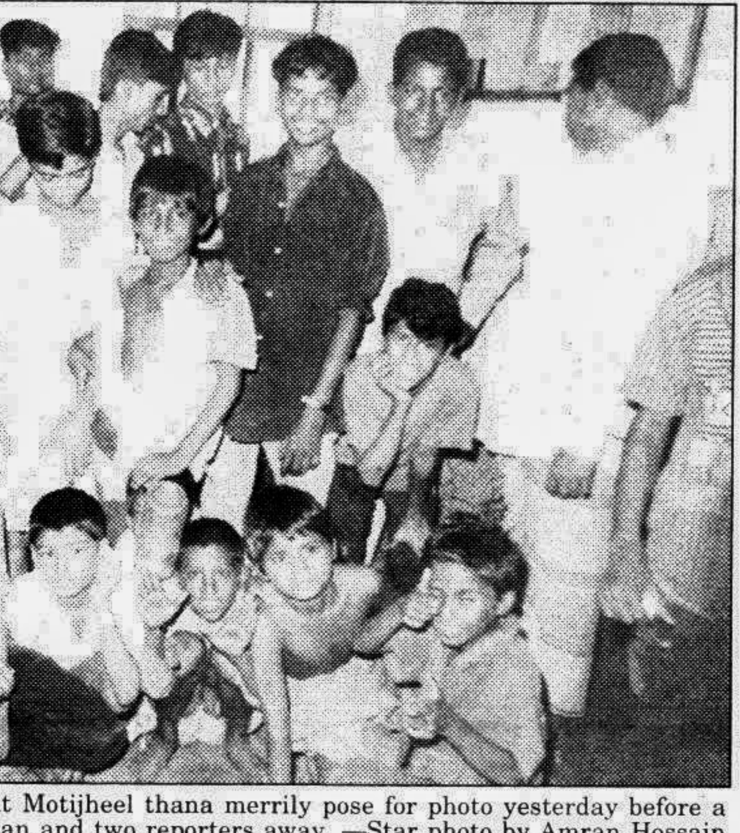
Some of the children detained at Motijheel thana merrily pose for photo yesterday before a police officer drove a Star lensman and two reporters away.