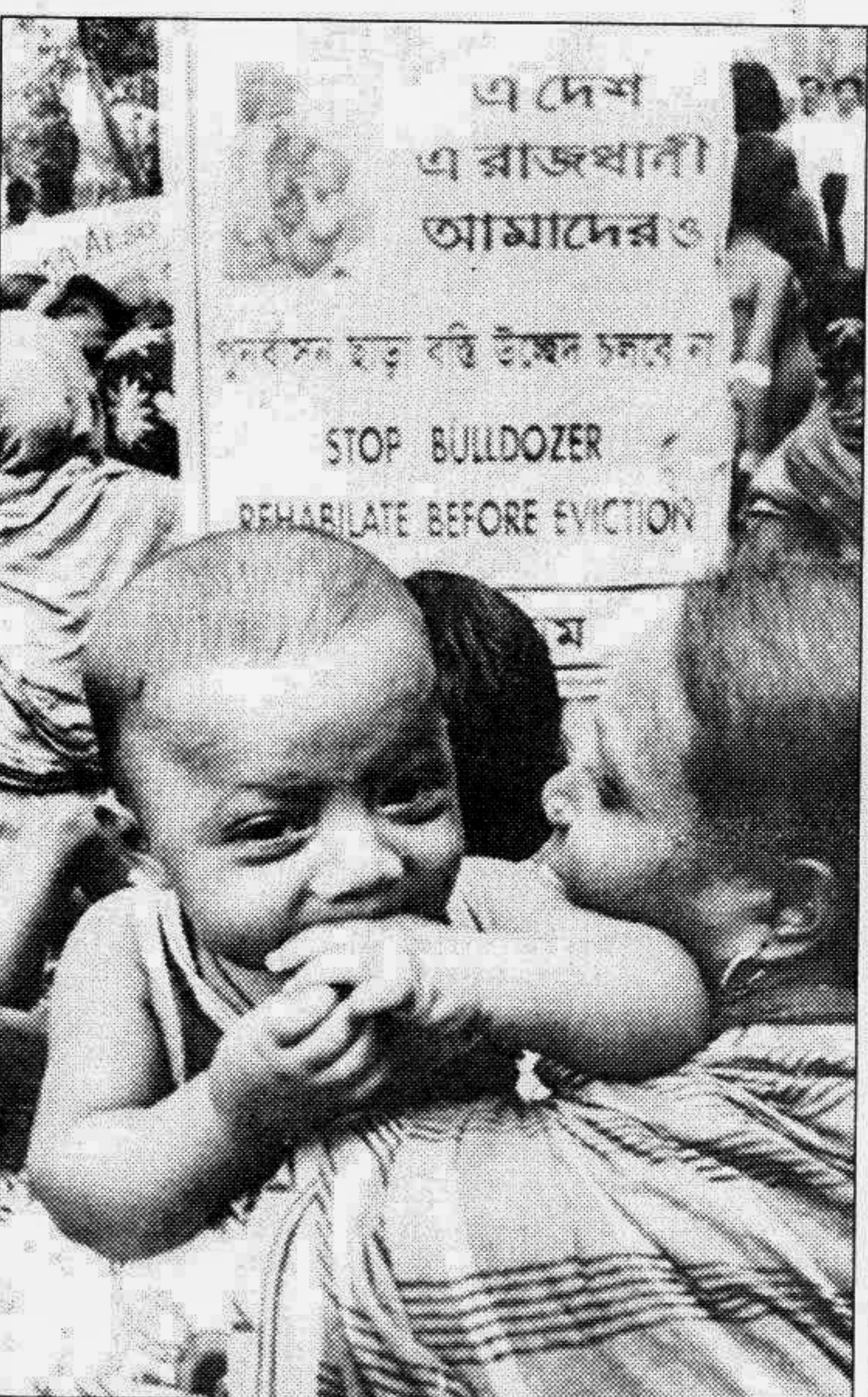
Slum dwellers evicted from the metropolitan city yesterday held a rally in front of Hotel Sonargaon during the hartal hours demanding their proper rehabilitation.