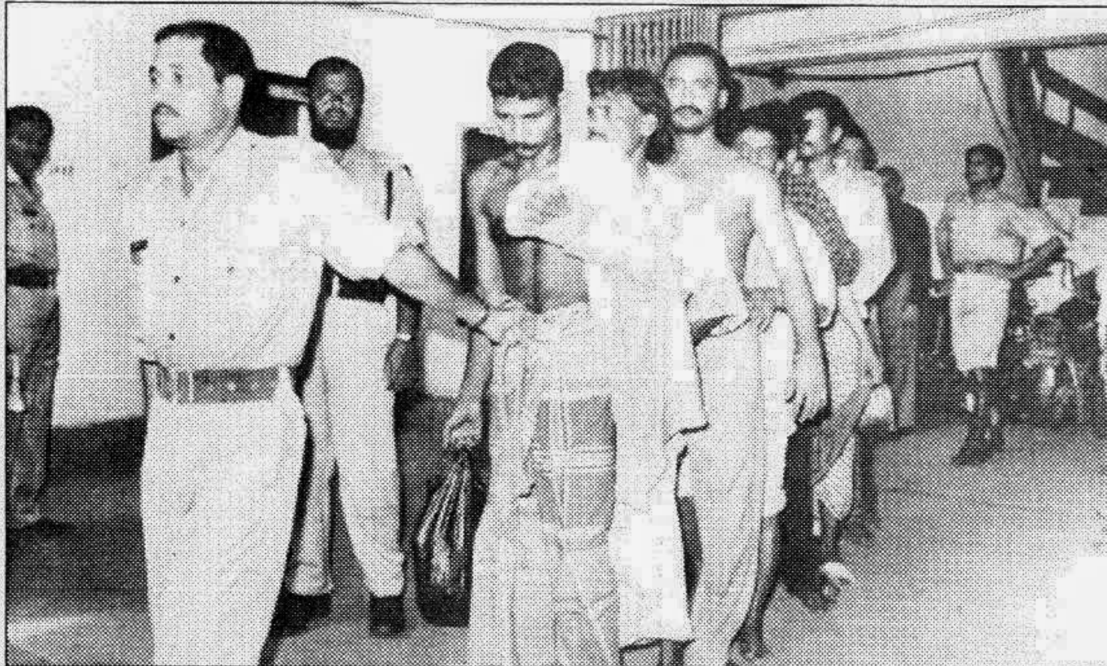
Police indiscriminately rounded up young men from around the BNP office at Naya Paltan yesterday during the hartal hours. These men are being sent from Motijheel thana to the court custody.