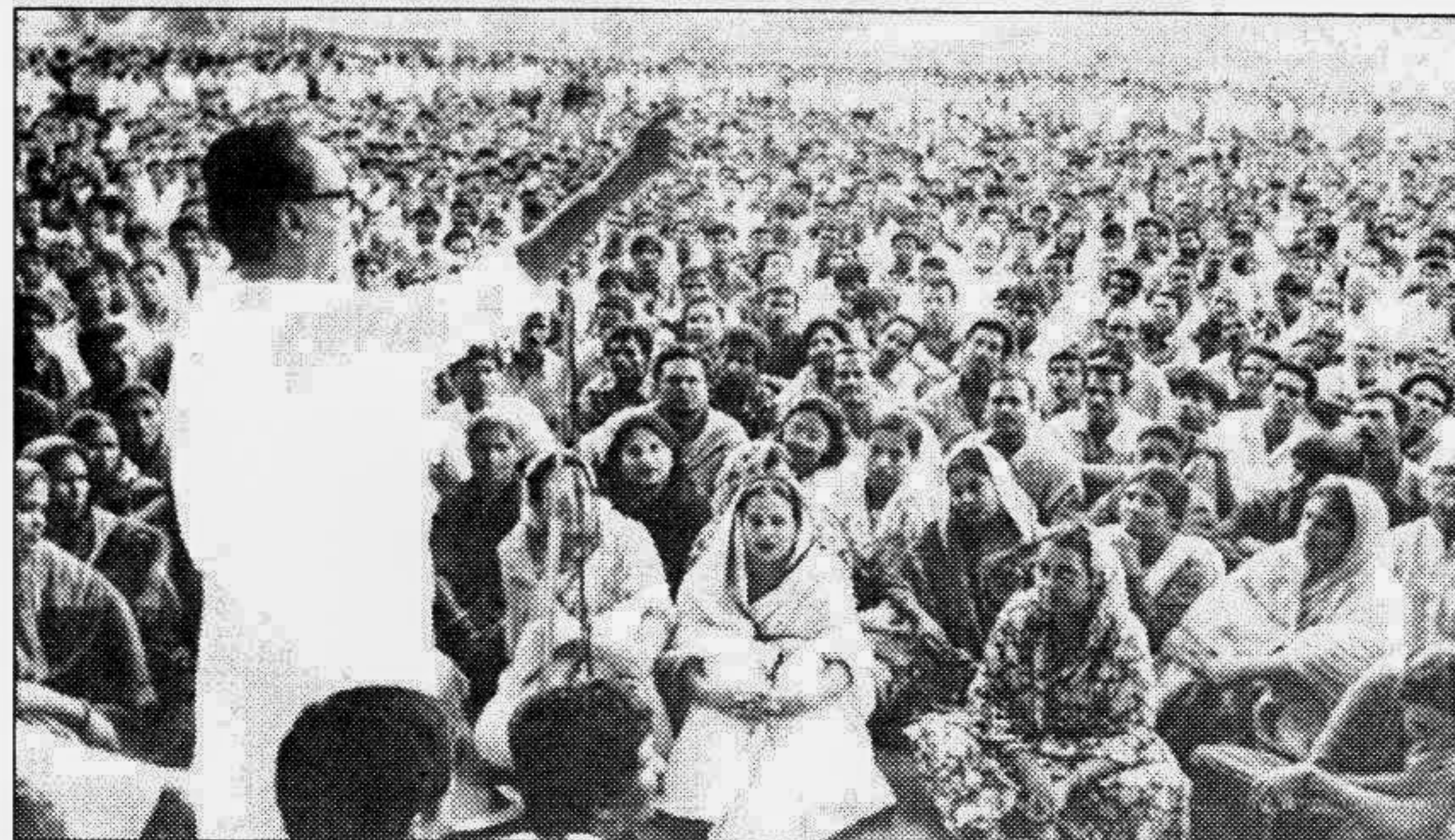
Zillur Rahman, general secretary of Awami League and Minister for LGRD and Cooperatives addressing an anti-hartal rally at Paltan Maidan yesterday.