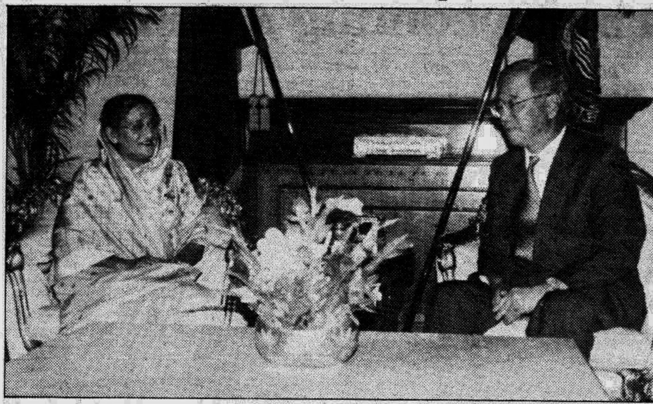
The outgoing Japanese Ambassador in Bangladesh Yushikazu Kaneko called on Prime Minister Sheikh Hasina at her office yesterday.

RAJSHAH ZONE : Butterfly Marketing Limited: Station Road: Sirajganj (0751) 52658, Gulf Electronics: S.S. Road, Sirajganj (0751) 72988, 017495077.