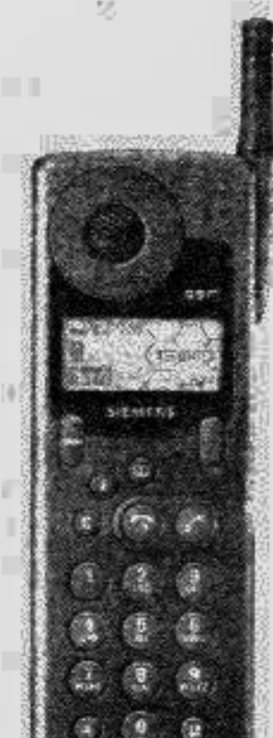
SIEMENS S6 D (Power)