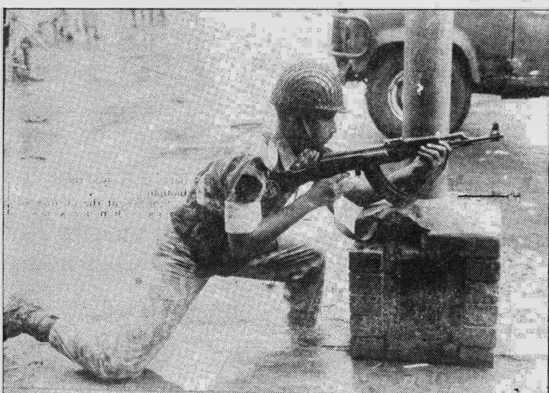
All set for action A BDR jawan takes his position in front of the sports council at Motijheel during the opposition's sit-in demonstration programme.

Commemorative stamp Bangladesh Post Office will issue a commemorative postage stamp valued at Tk 6 denomination today on the occasion of 25 years (1974-1999) of Bangladesh in the United Nations, reports UNB. A first day cover valued Tk 6 will also be issued and a special canceller will be used, said a press release. The stamp and first day cover will be sold from all Head Post Offices, including four GPOs. The commemorative postage stamp will subsequently be sold from all post offices including the extra-departmental ones.