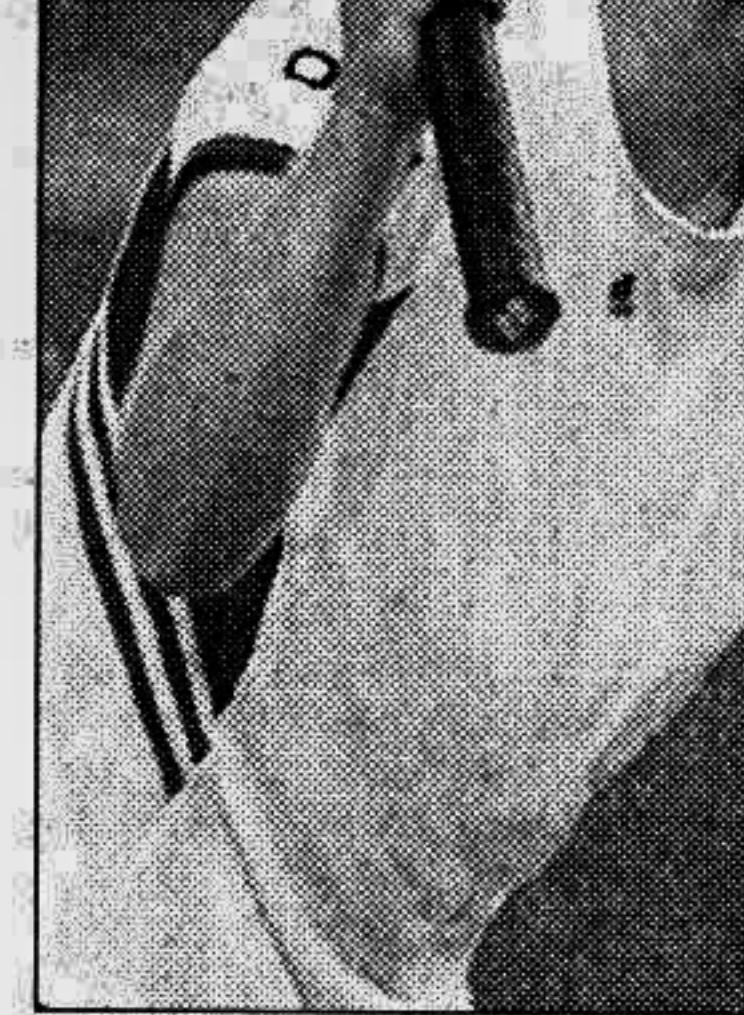
World number one Martina Hingis rejoices after reaching the US Open final. The Swiss star saw off American Venus Williams in the semifinals.