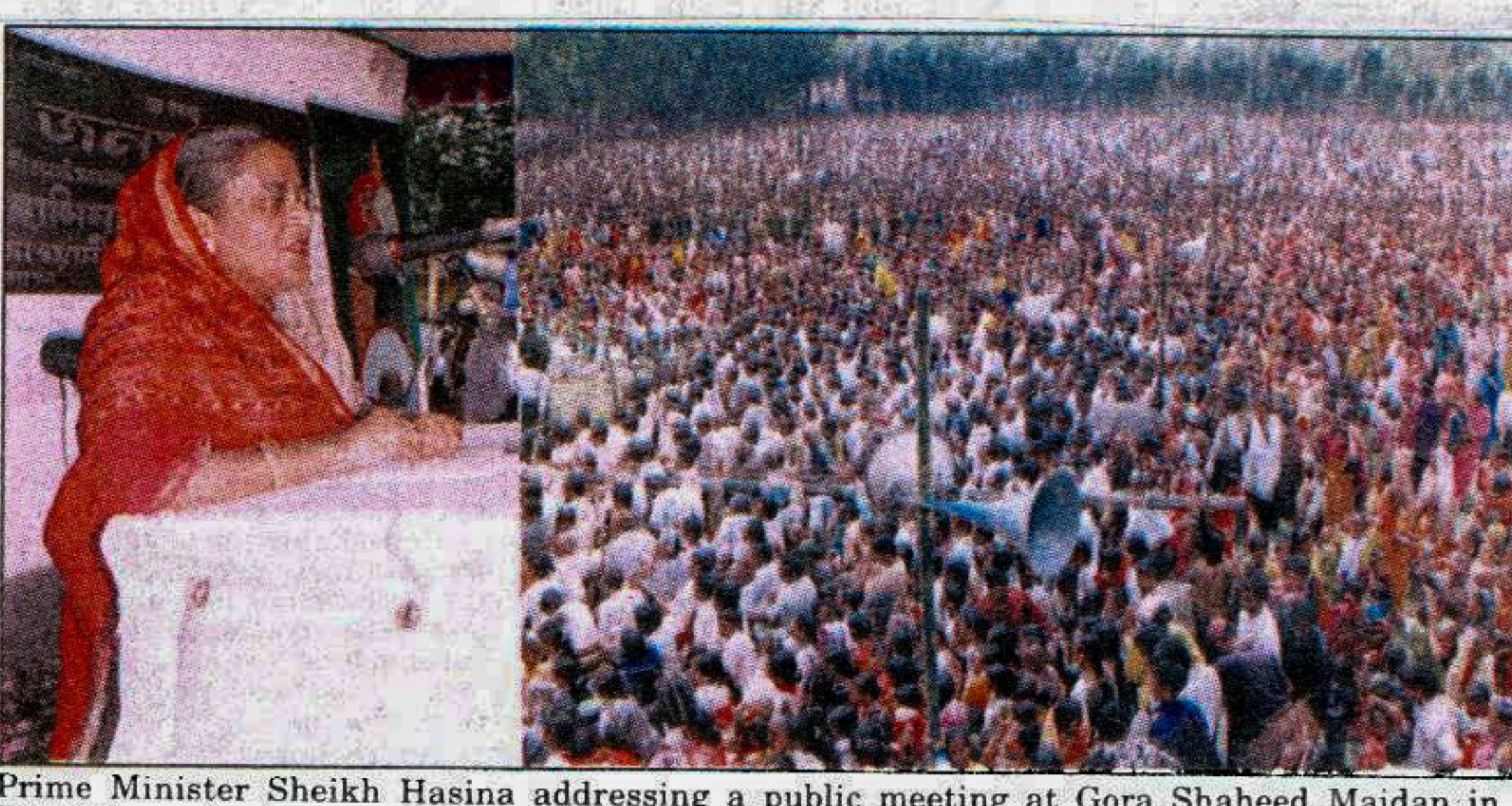
Prime Minister Sheikh Hasina addressing a public meeting at Gora Shaheed Maidan in Dinajpur yesterday.