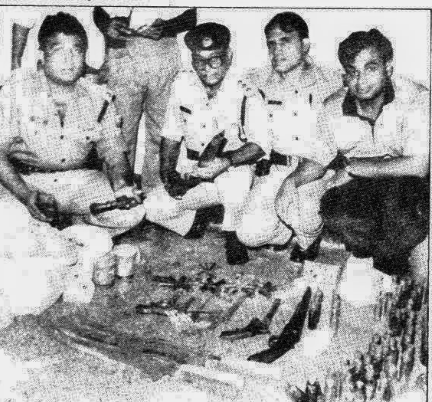
Police recovered a large quantity of arms, ammunition and bomb making materials from old city yesterday.

In another operation, a team of Demra police recovered two guns and a revolver with 26 bullets from a house at Nurpur in South Dhania in the early hours of yesterday. Two persons were arrested in this connection.