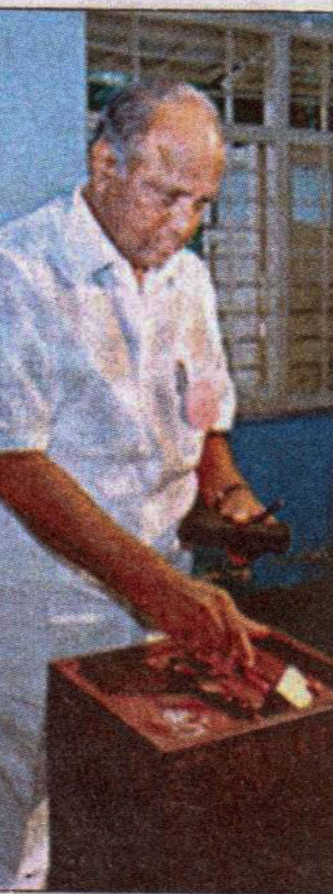
Sharad Pawar casting his vote in Baramati, yesterday.

NEW DELHI, Sept 11: Hundreds of thousands of troops guarded polls today during the second phase of India's massive elections, after caste clashes, murders, an assassination attempt and election fraud marred the lead-up to the voting, reports AP.