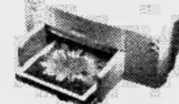
HP DeskJet 810C