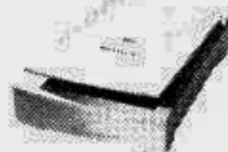
HP ScanJet 3200C

Hewlett-Packard also extends our well-wishes to the HP registered retailers and wholesalers at IDB. Together with our partners, we hope to serve our customers better by offering a total solution that ranges from computing to digital imaging. It is our commitment to deliver our products and service with the legendary HP quality and reliability.