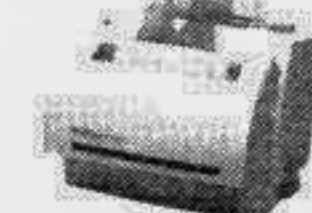
HP LaserJet 1100A