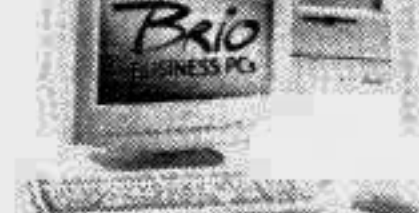
HP Brio Business PC