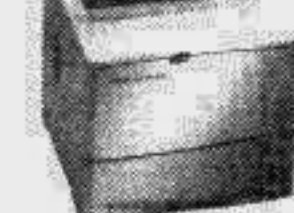
HP LaserJet 4050