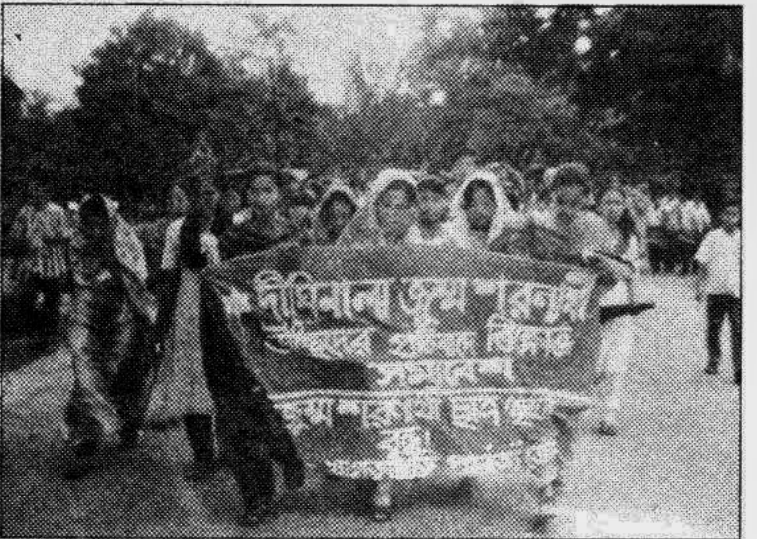
A recent protest rally of the tribal students in Khagrachhari town.