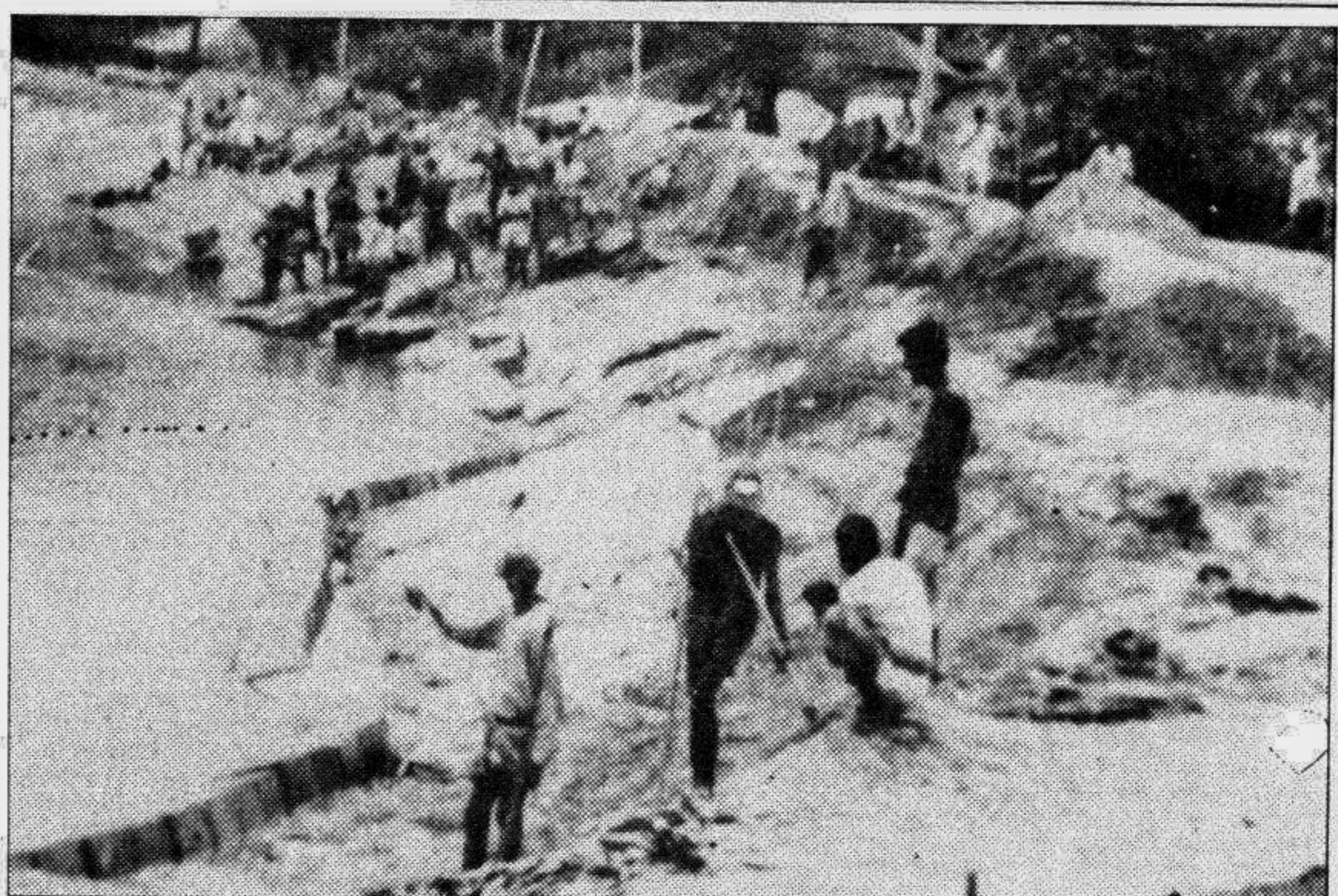
Water Development Board personnel frantically trying to repair damaged by the erosion of the Modhumati river near Bherarhat in Gopalganj district.

Most of the suicide cases occurred due to family conflicts.