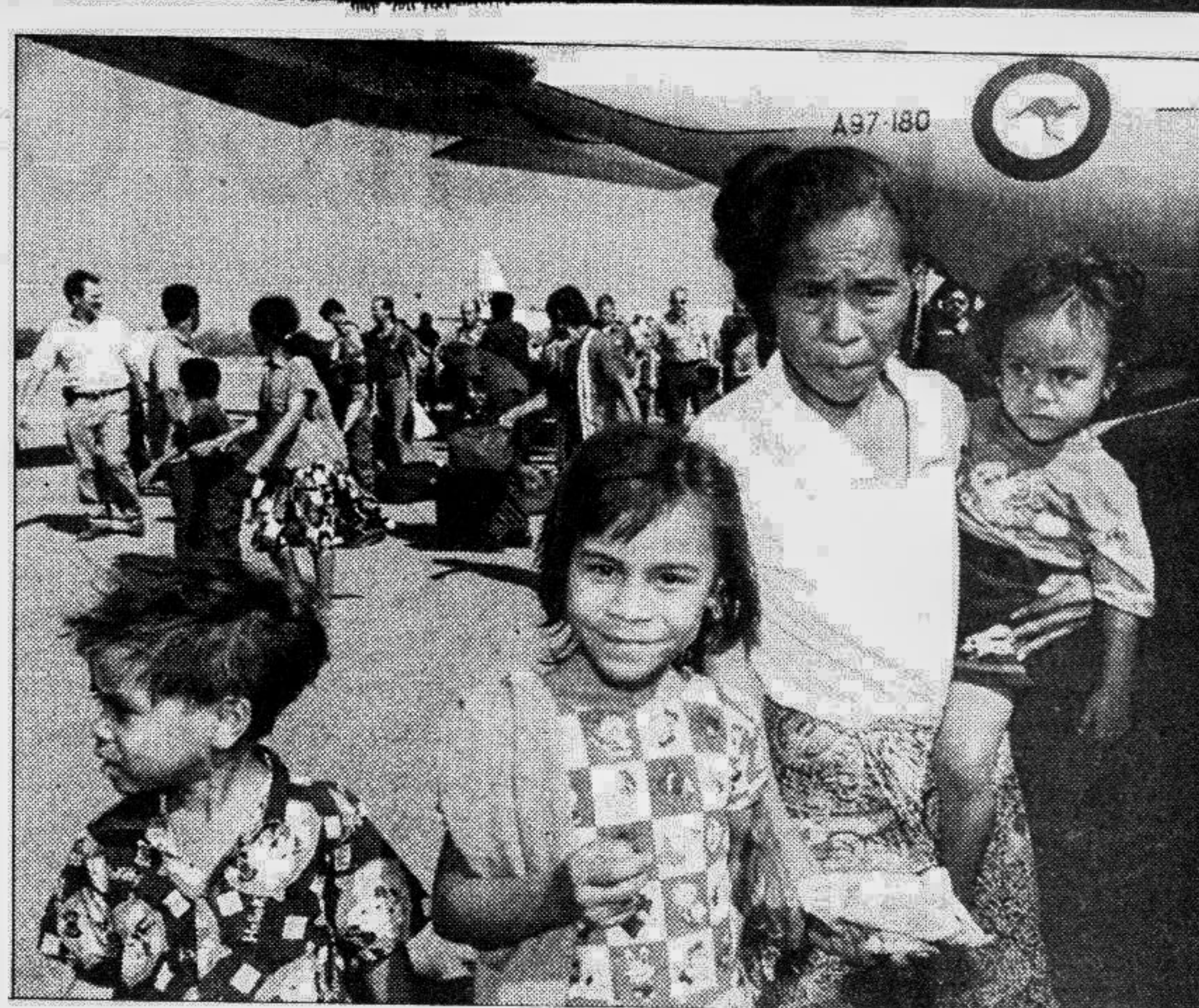
East Timorese refugees upon their arrival at a transit centre in Darwin following their evacuation from the violence-ridden territory yesterday. The UN said it hoped to evacuate all 171 local staff workers and more than one hundred family members from the UN compound in Dili.

The Australian-based National Council for Timorese Resistance said two truckloads of East Timorese women and children were taken in recent days from refugee camps in West Timor and slaughtered by militiamen.