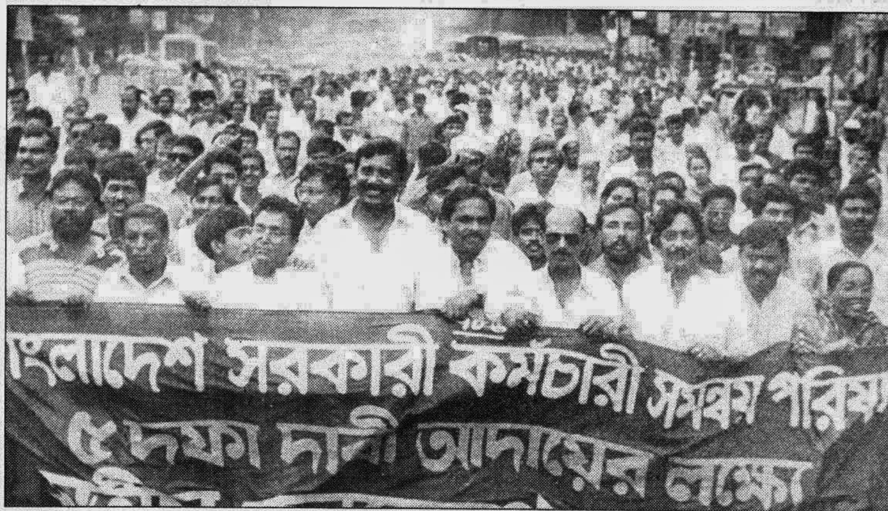
Bangladesh Sarkari Karmachari Smannya Parishad (Bangladesh Government Employees Co-ordination Council) brought out a procession in support of its 5-point demand in the city yesterday.