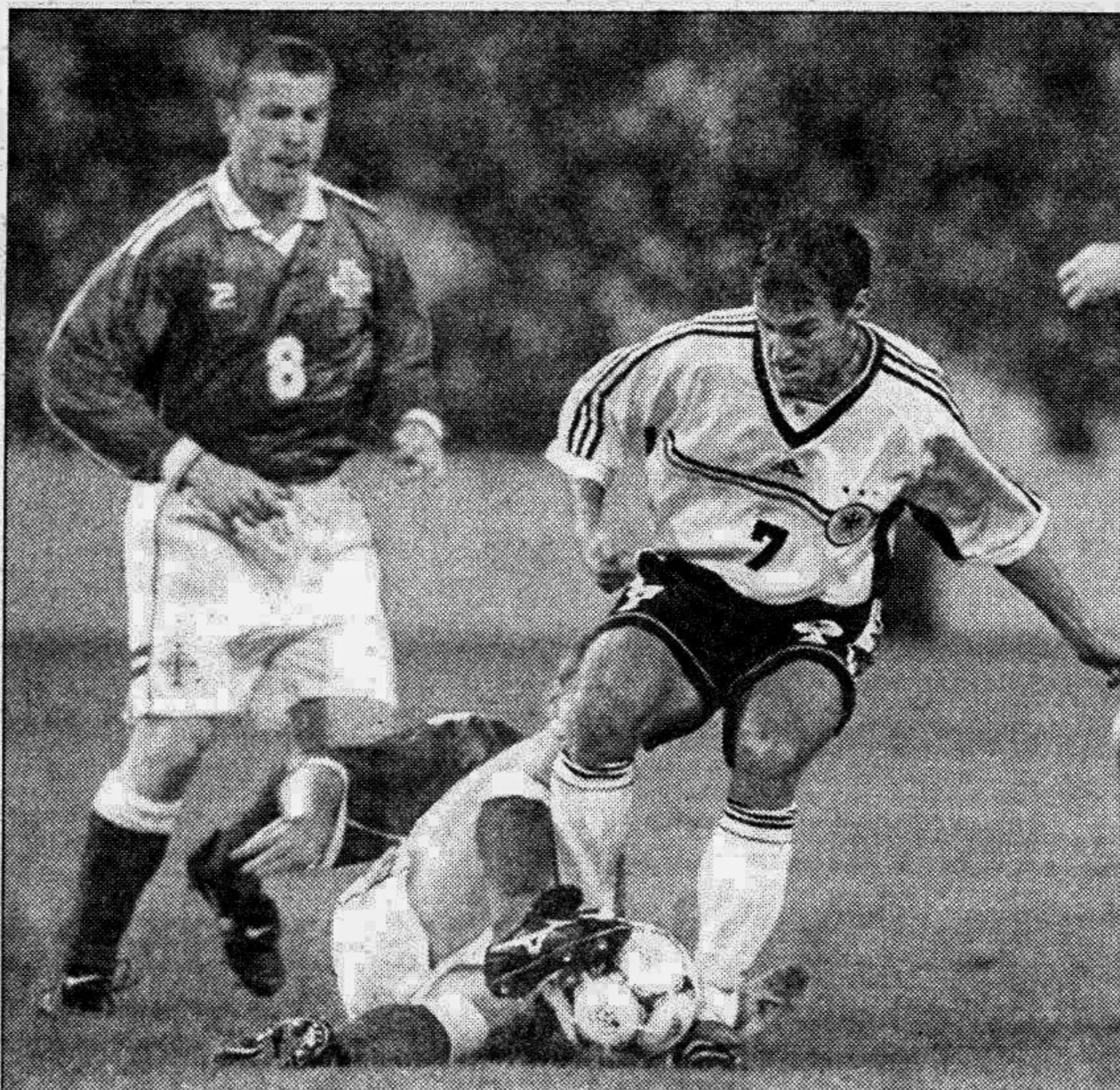
German Mehmet Scholl (R) fights for the ball with Northern Ireland's Ian Nolan in their Euro 2000 qualifier.