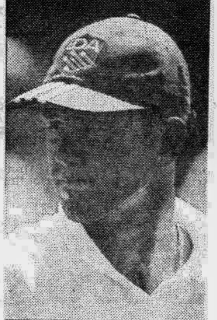
RICKY PONTING ... 96 rallitharan, the most successful Sri Lanka bowler with four for 63.

Australia lost only Gillespie between lunch and tea. He was leg before to off-spinner Muttiah Muralitharan.