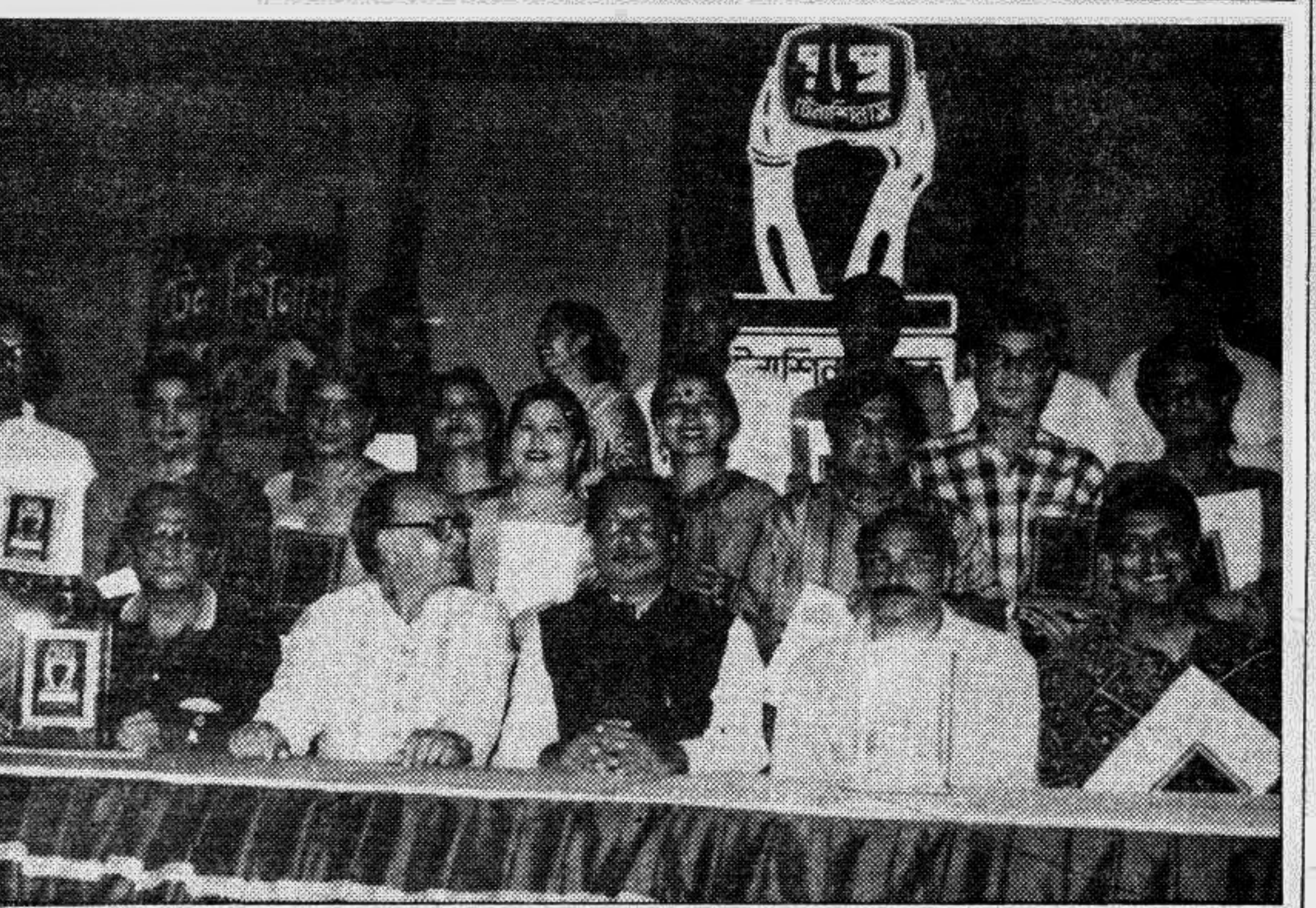
Recipients of the BTV Nattya Shilpi O Nattayakar Sangshad's Tenashinas Awards '95, '96, '97 and '98 at Dhaka Mahanagar Nattya Mancha yesterday.

Police said the arrested were involved in arms manufacturing and trafficking in the city for long time.