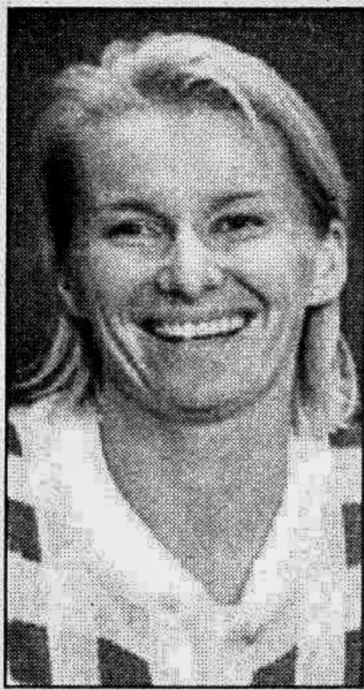
Jana Novotna (Czech tennis player)

"I've been thinking about this for a very long time. I just feel the time for it is right." While announcing her retirement on Monday.