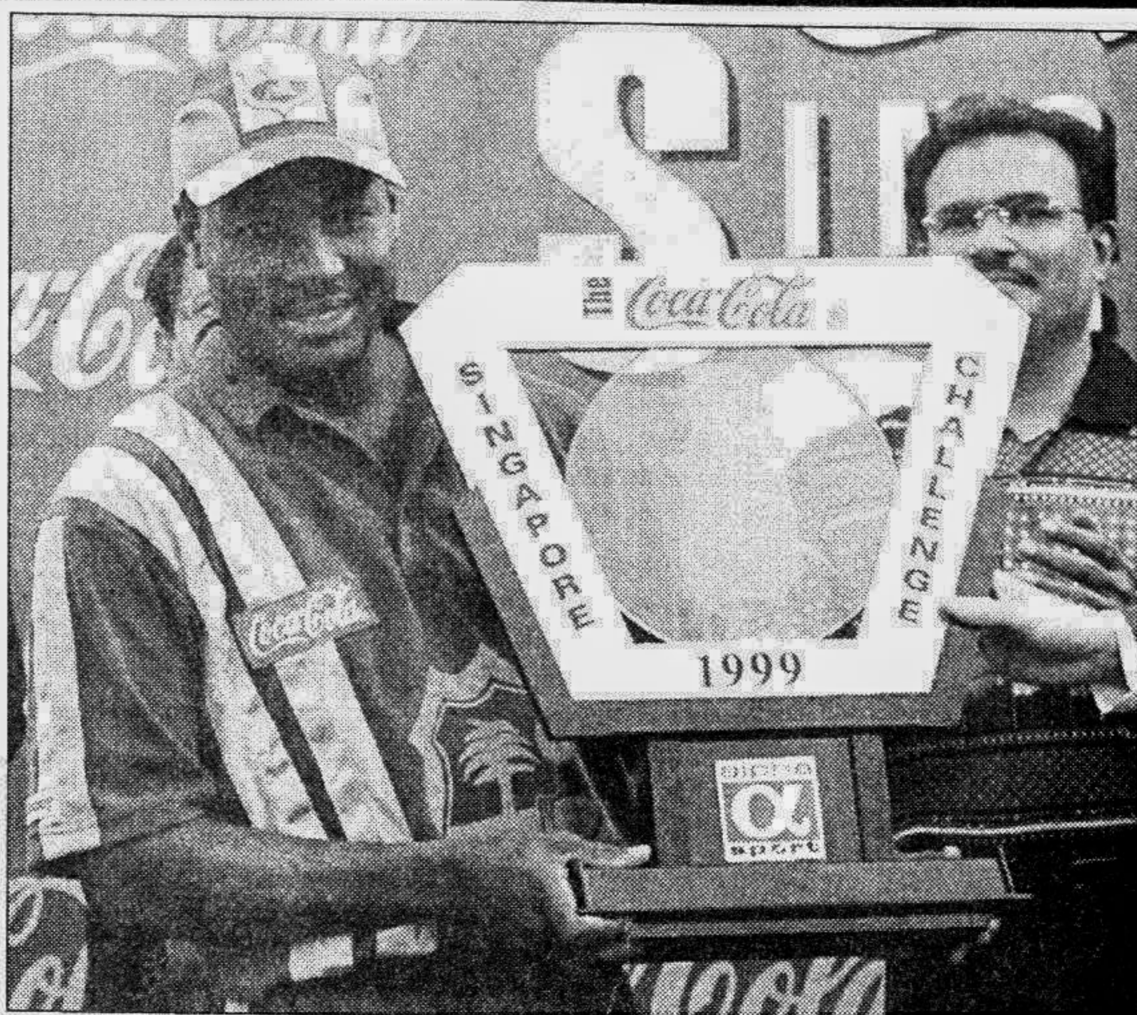
DESERVING WINNERS: Brian Lara (L), the West Indies captain, proudly holds the Coca Cola Singapore Challenge trophy after his team's four-wicket victory over India in the final yesterday.

Equally, Warne's dropping for the last Test in the West Indies may have been a blessing. Certainly it helped refocus his mind. He could take nothing for granted.