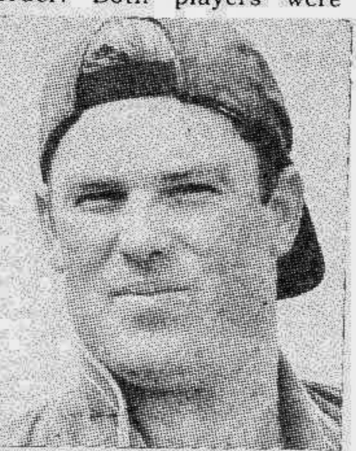
SHANE WARNE dropped from the one-day squad following Sri Lanka's disastrous performance in the World Cup.

The Sri Lankan selectors have recalled Ranatunga and De Silva to stabilise the middle-order. Both players were