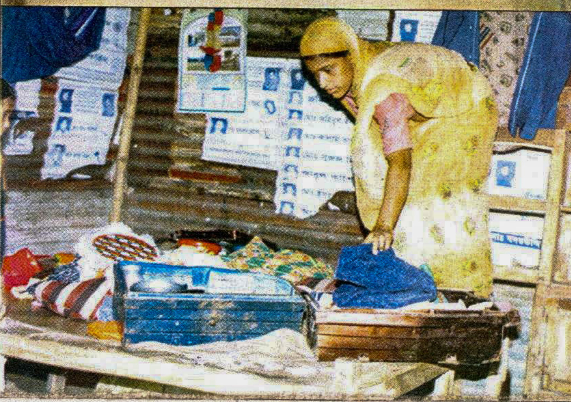
Police guarding the Chand Textiles Mills after fierce gunfight between two rival groups (top), a ransacked room of the mill colony.