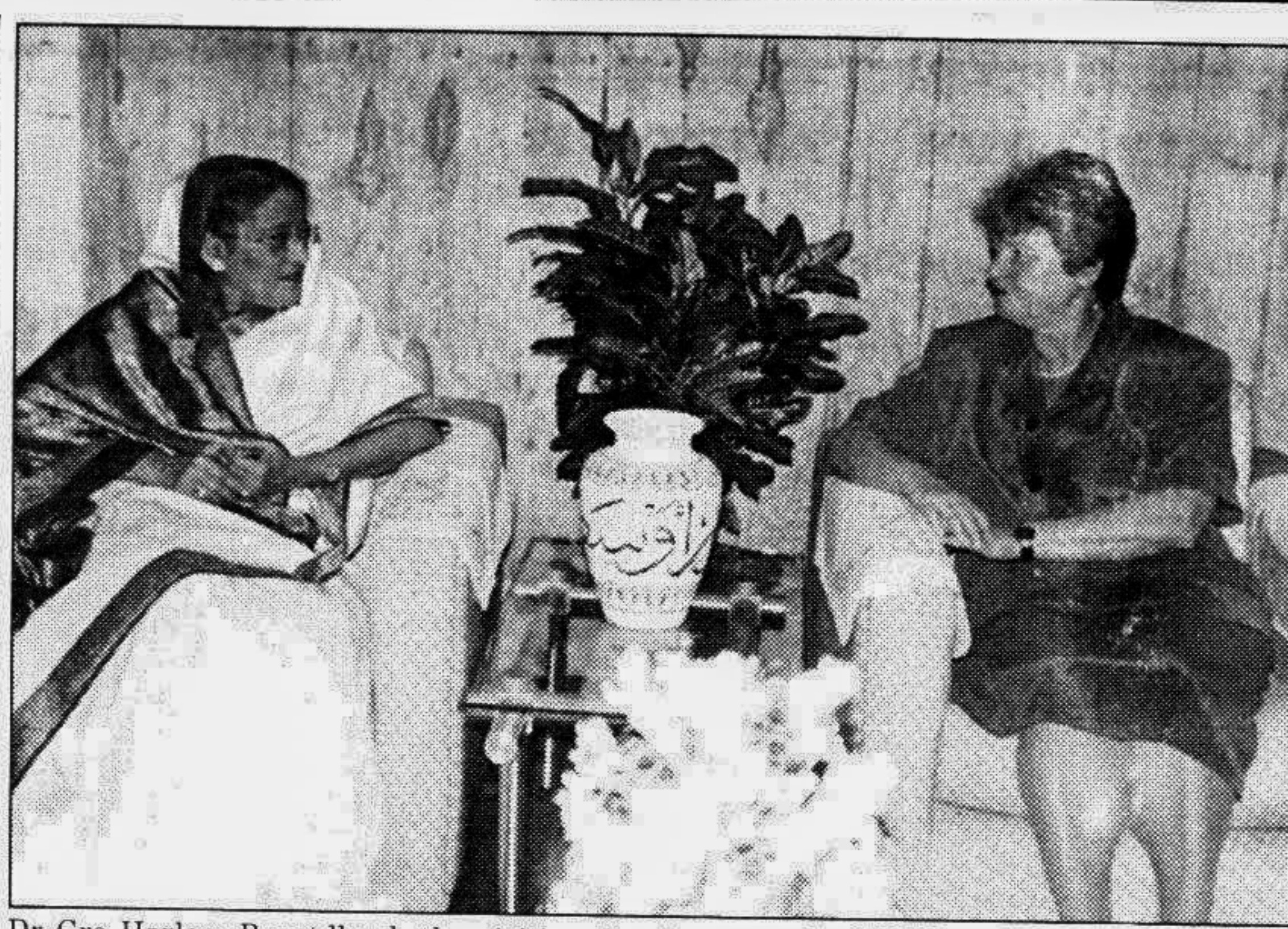
Dr Gro Harlem Brundtland, the visiting director general of WHO made a courtesy call on Prime Minister Sheikh Hasina at her Sangsad Bhaban office yesterday.