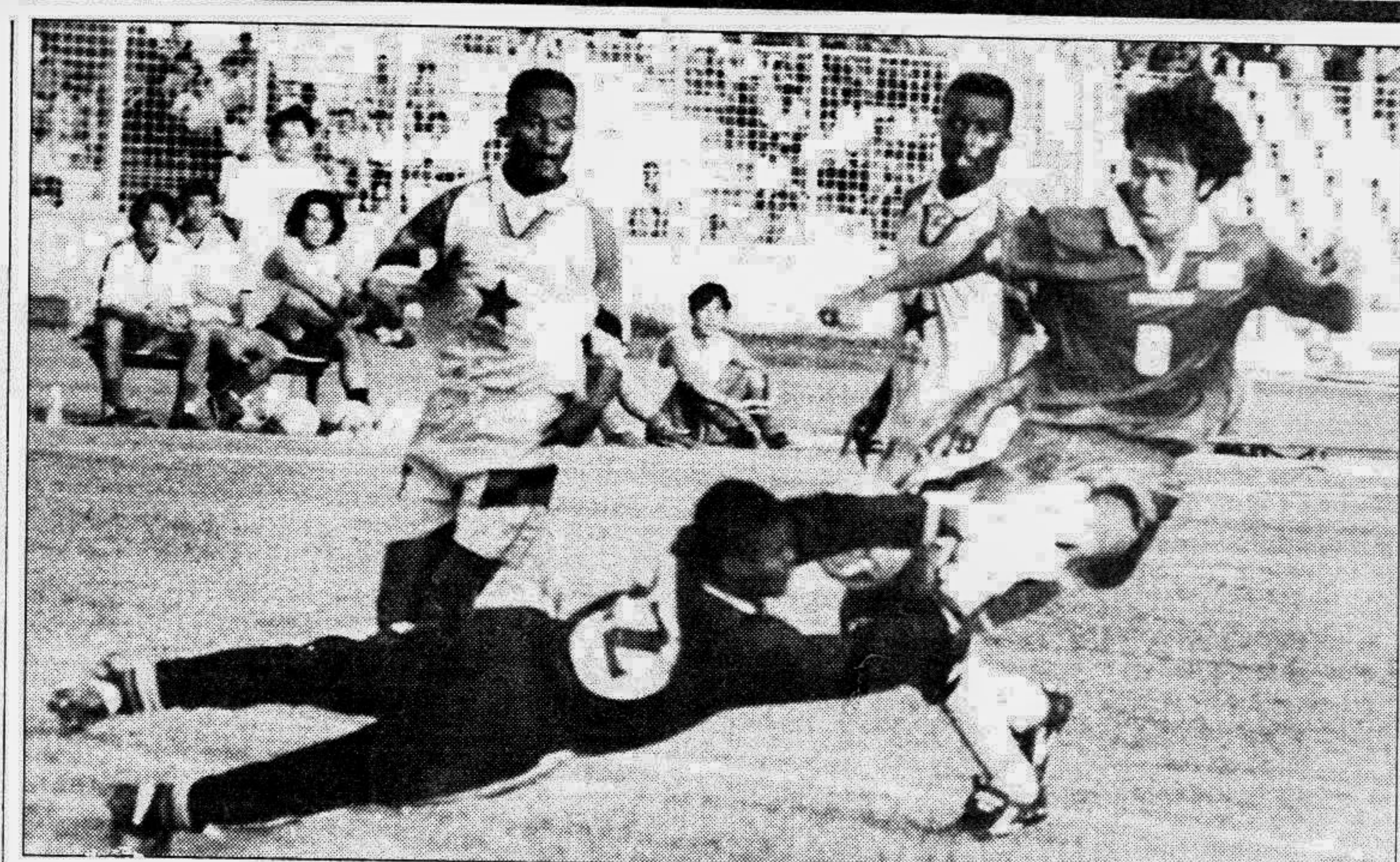
A Japanese attack in the Ghanaian goalmouth during yesterday's final of the 2nd Bangabandhu Cup International Football Tournament at the Bangabandhu National Stadium.