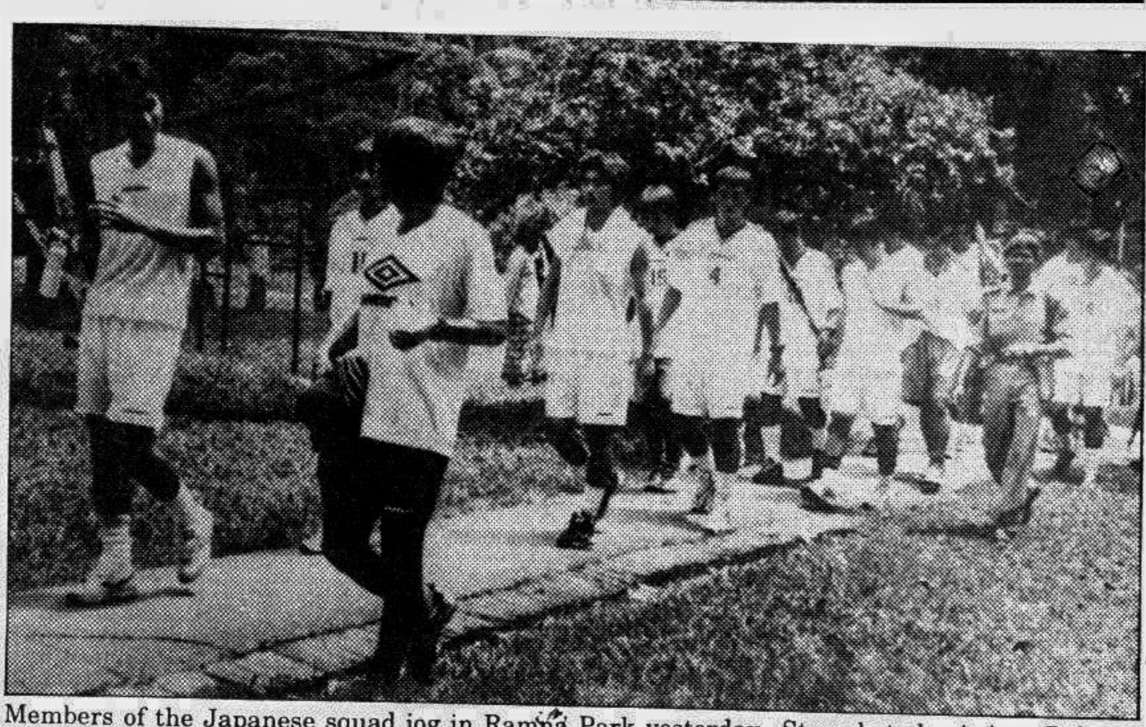
Members of the Japanese squad jog in Ramna Park yesterday.