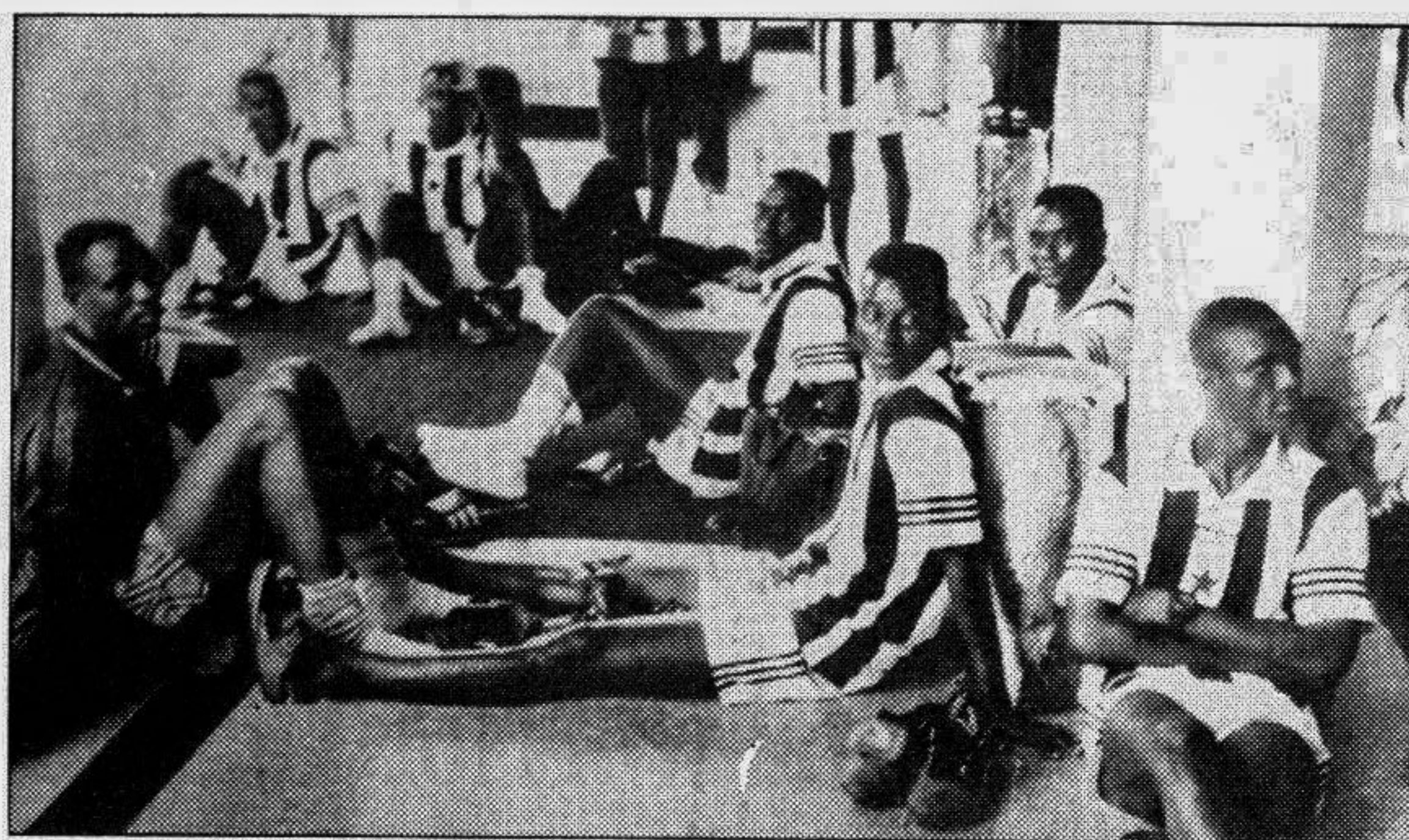
The Ghanaian footballers relaxing in Sheraton hotel balcony.

The champion and the runners-up will receive cash award of taka five thousands and taka three thousands respectively. The best player-of-the-final and the highest scorer will also be awarded.