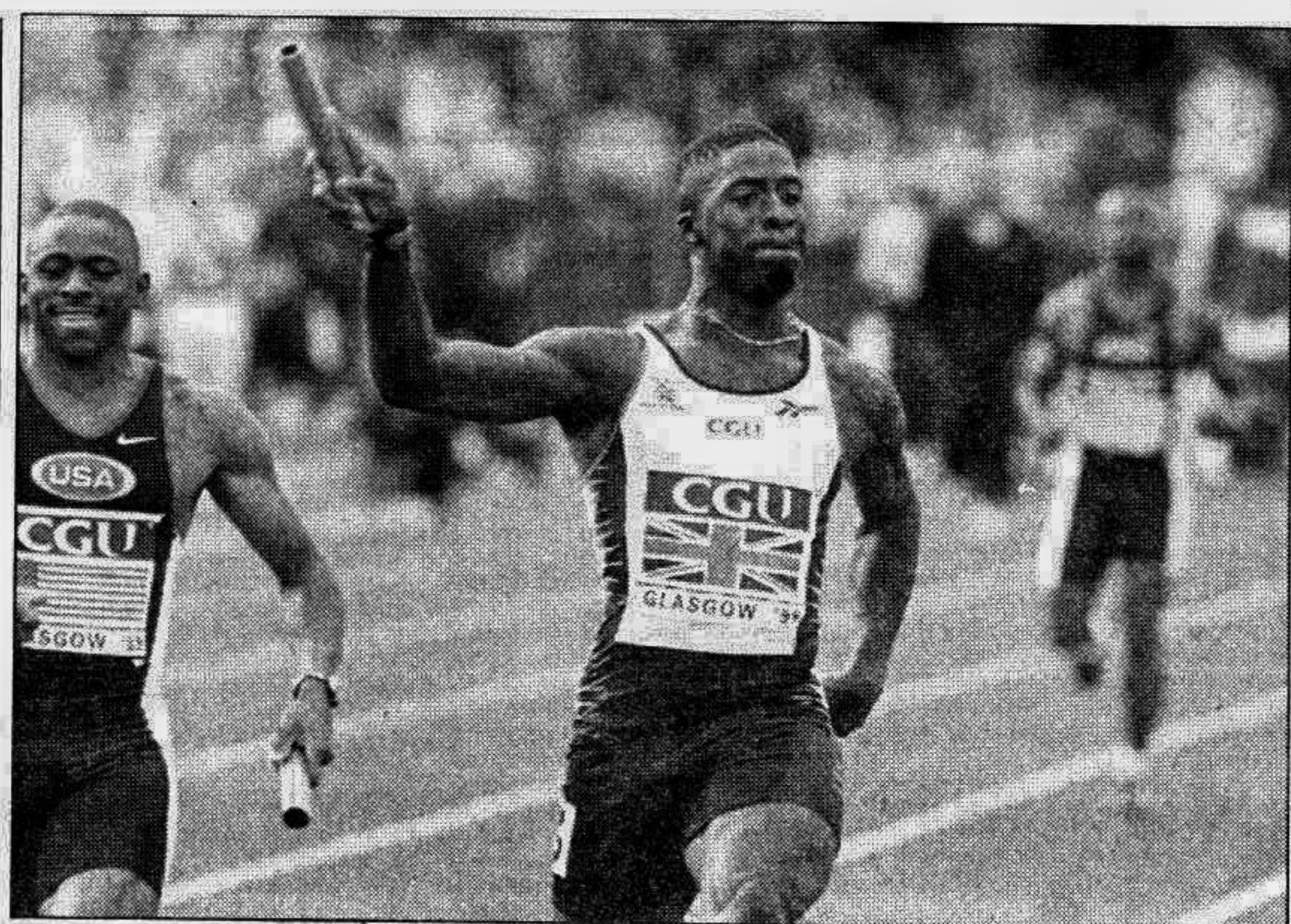
Britain's Dwain Chambers touches the finish-line in the 4x100m relay of a special athletics meeting between Great Britain and the United States in Glasgow on September 4.

GLASGOW, Sept 5: World record holder Maurice Greene saw off the challenge of Britain's young sprinters to win the 100m with a time of 10.16sec in the USA vs Great Britain international meeting here on Saturday, reports AFP.