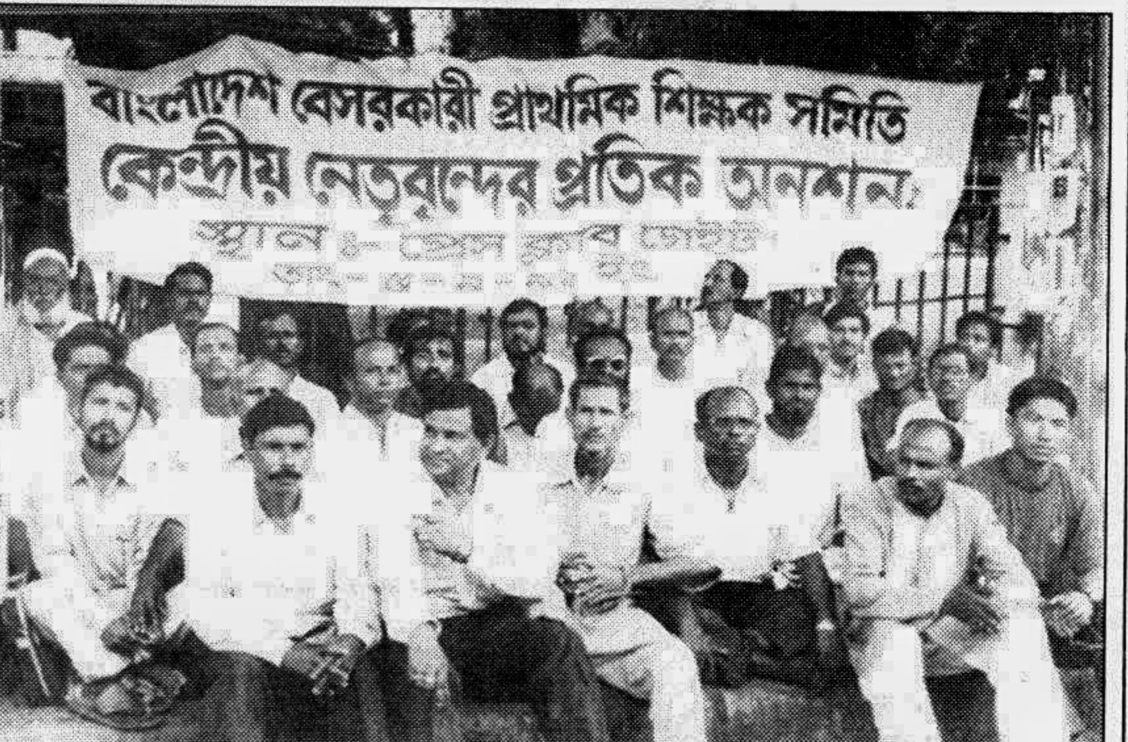
Bangladesh Non-Govt Primary Teachers' Association observed a token hunger strike in front of the Jatiya Press Club in the city yesterday.

The former foreign secretary, who is well known in international diplomatic circles and was once Chairman of the Group of 77 based in New York, noted that if he is elected, it would be Bangladesh's first victory in a globally recognised organisation.