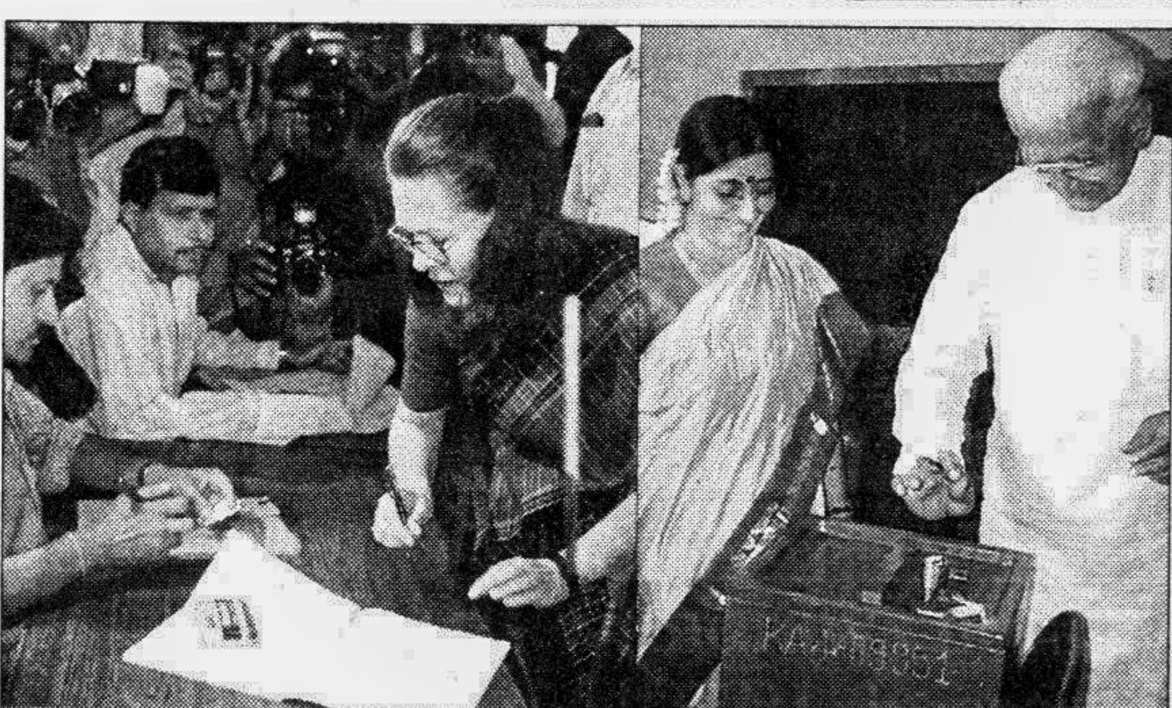
Congress candidate Sonia Gandhi casting vote at a polling station in New Delhi (left). Her rival Sushma Swaraj of BJP watching casting of vote in Bellary constituency yesterday.

One source pointed out that the energy ministry has been trying to reduce Petrobangla's See Page 12 Col 3