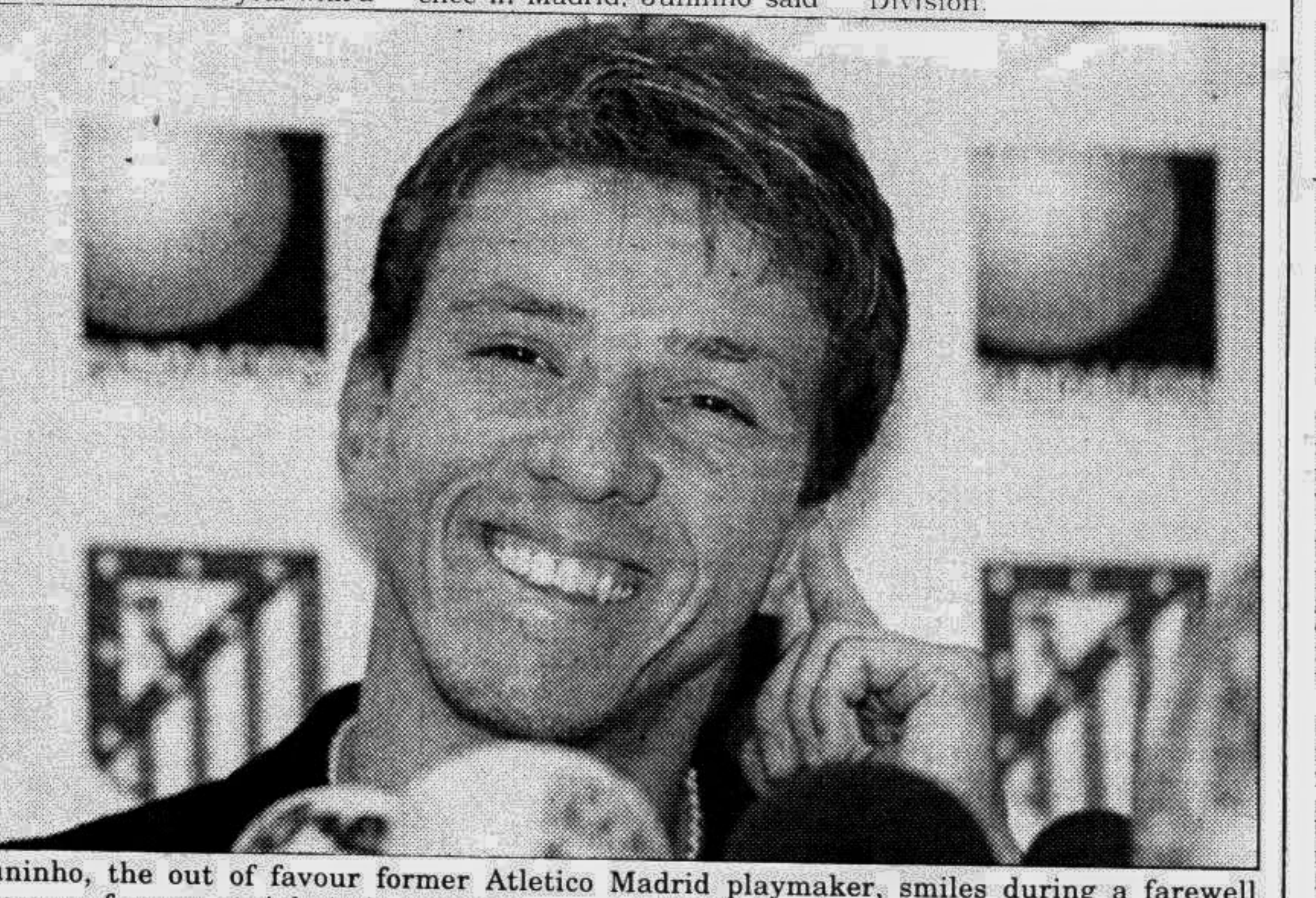
Juninho, the out of favour former Atletico Madrid playmaker, smiles during a farewell press conference at Atletico's training camp at Majadahonda on September 2. Juninho is expected to play in the English Premiership for Middlesbrough.

"They were obviously looking for players with different abilities," Juninho said. "They have their system and they just don't suit me."