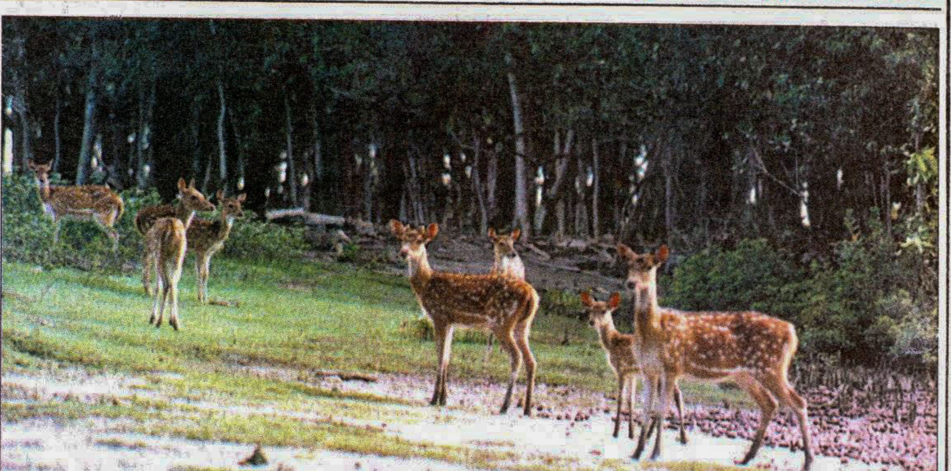
Shattered silence Inquisitive but boisterous tourists have become a potent threat to the spotted deer in the Sundarbans, the world's largest mangrove forest.