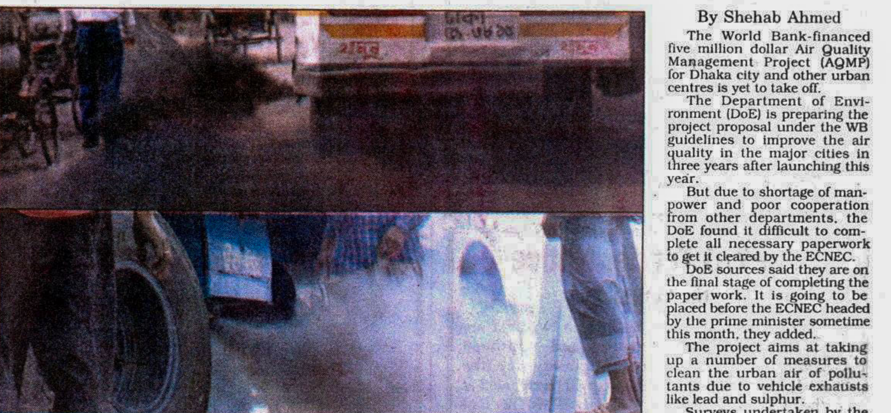
Sinister smoke Pollutant-spewing city buses continue to make mockery of the much-publicised campaign for clean air in the capital.

Imported lead-free gasoline to get lead again!