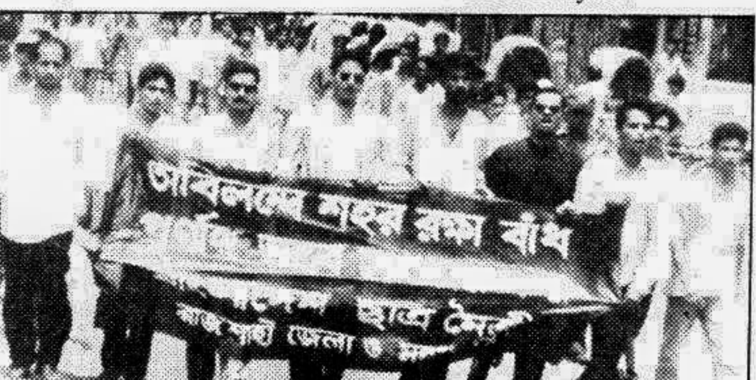
Save the city: Rajshahi city unit of Bangladesh Chhatra Maitree recently brought out a procession in the city demanding immediate renovation of Rajshahi town protection embankment.

BKB had fixed the target of recovery of outstanding loan at Taka 8,60,00,000 in the region in the last fiscal year.