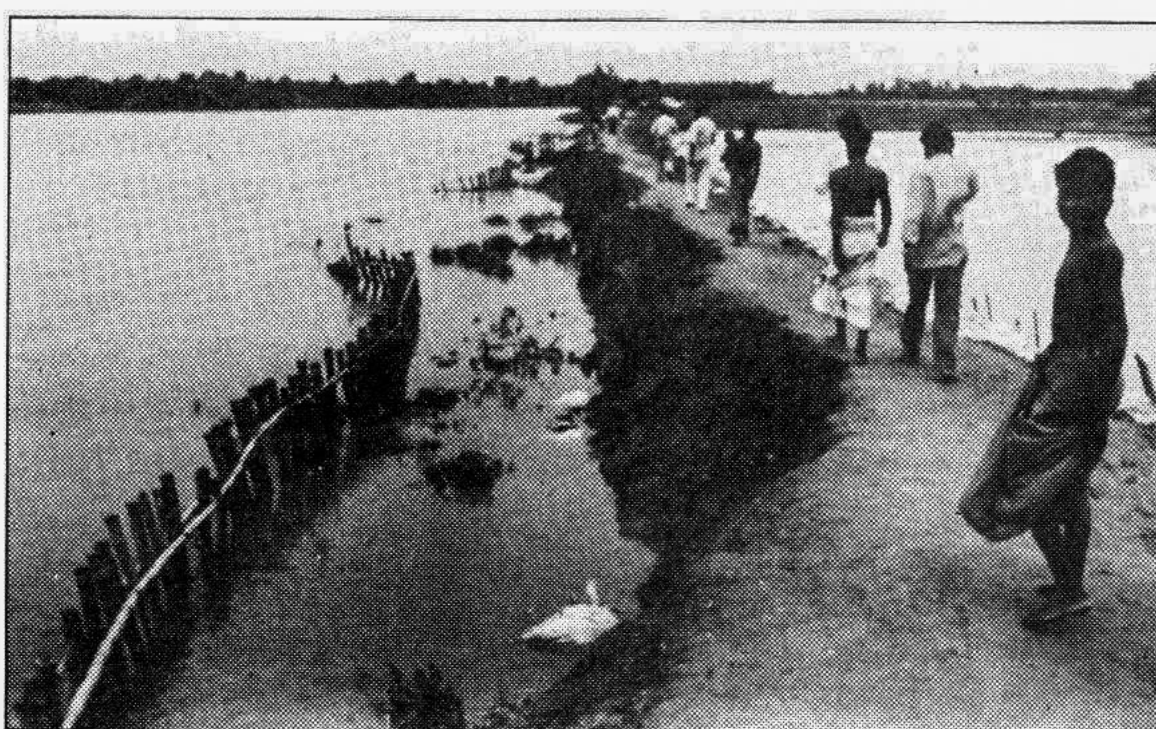
Damaged Sakpala embankment along the River Katakhal in Gobindaganj thana of Gaibandha district.

On August 29 the local people of Kamarjani area brought out a procession demanding steps to check erosion. They laid siege to the Deputy Commissioner's (DC) office and Water Development Board (WDB) office and for taking emergency precautionary measure to halt the erosion. They handed over a memo to DC.