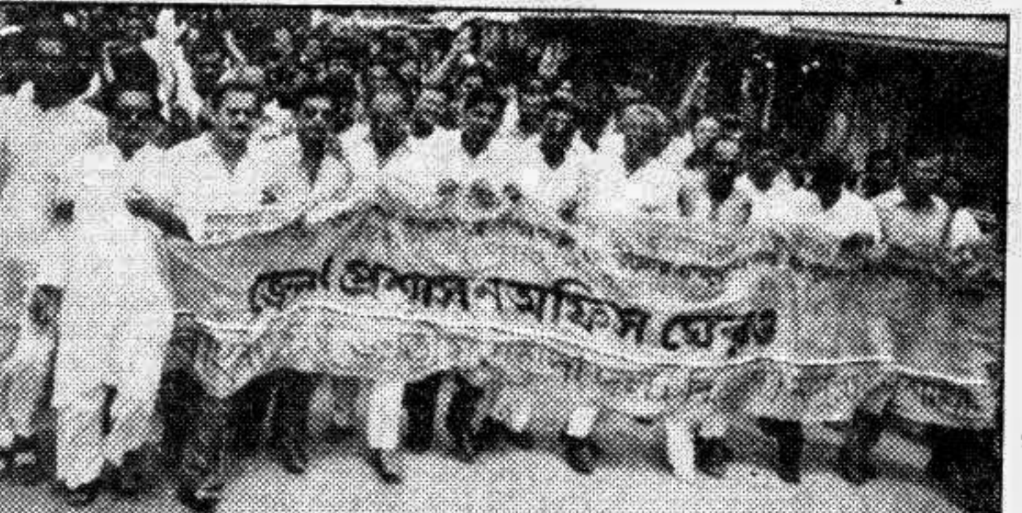
Magura district unit of Bangladesh Nationalist Party (BNP) brought out a procession in the town recently as part of the party's out-government movement.