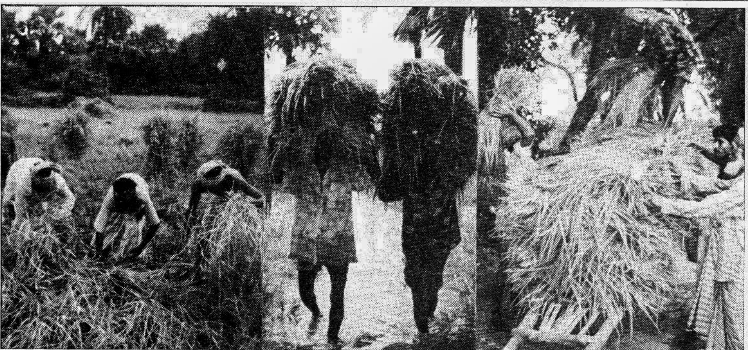
Season of harvesting: Ripe golden Aus paddy brought new hope for Magura farmers who are engaged in harvesting the paddy at village Boro Khori in the sadar thana recently.

Gobindaganj thana are now threatened by erosion. If the embankment is damaged water will directly submerge the national highway. A 100-year-old mosque at Kaiyaganj on the bank of the River Katakhal may erode at any time. However, WDB personnel are working round the clock to stop seepage at the embankment site with sand bags and bamboo pilings.