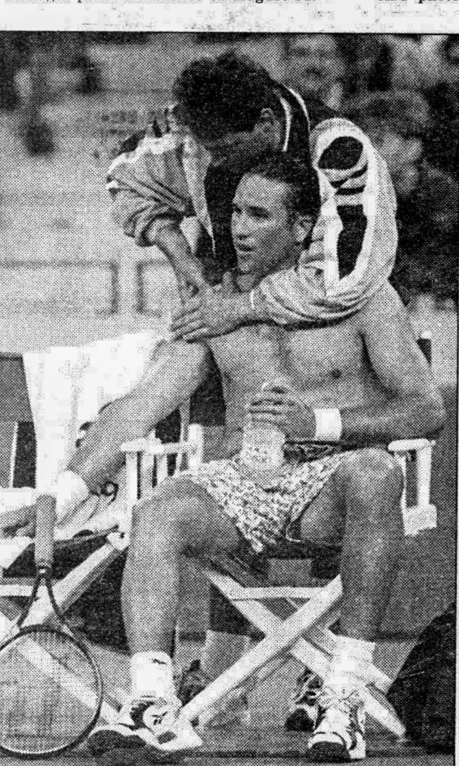
Defending US Open champion Patrick Rafter receiving treatment during his match against Cedric Pioline.