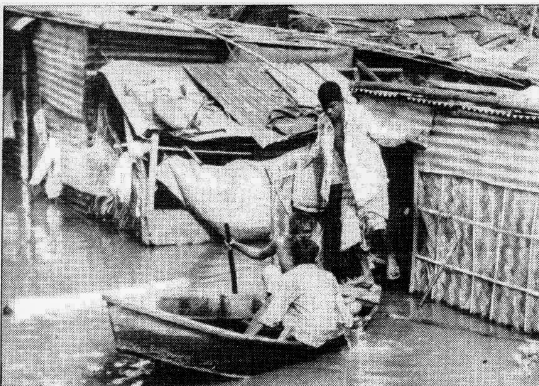
Low-lying areas in the city have been inundated by flood waters. The photo was taken from a place near Gulshan yesterday.

Participating countries include Indonesia, Malaysia, Kuwait, Sri Lanka, Iraq, Lebanon, Palestine, Pakistan, Qatar, Philippines, Kazakhstan, Nepal, Jordan, South Korea, Singapore, Bhutan, Vietnam, Yemen, China, Laos, Mongolia, Thailand, Saudi Arabia, Cambodia, Tonga, the Maldives and Uzbekistan.