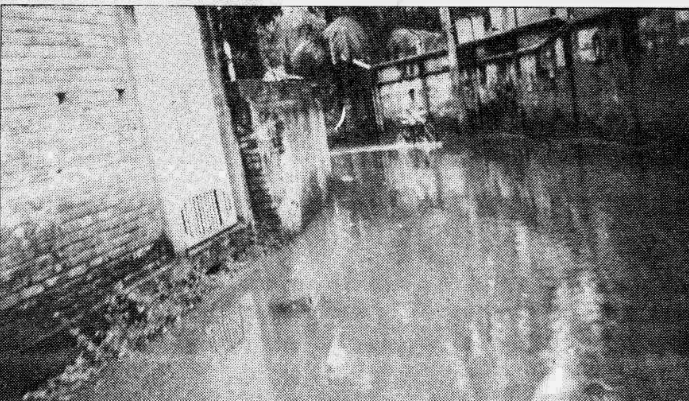
Submerged Beltala road near Pabna Shaheed Rafiq Girls' High School causes untold sufferings to the town dwellers of the area. Medium rainfalls have created such water logging here.

PABNA, Aug 31: The century old Pabna municipality lacks all kinds of civic amenities, causing immense sufferings to nearly one lakh and seventy-five thousands people in the area.