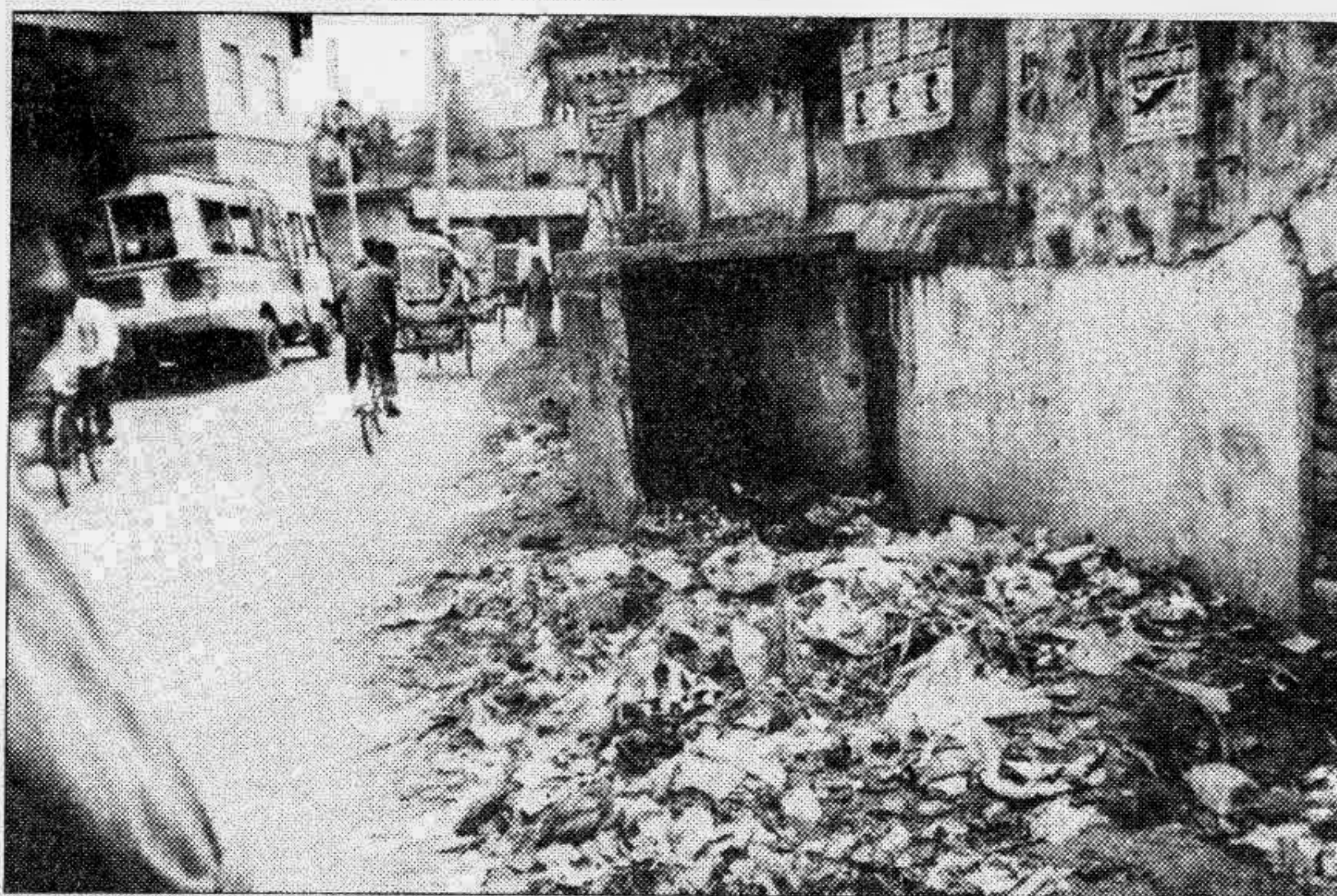
Unhealthy environment: Loitered wastes polluting the environment of densely populated Gopalpur area in Pabna Municipality.