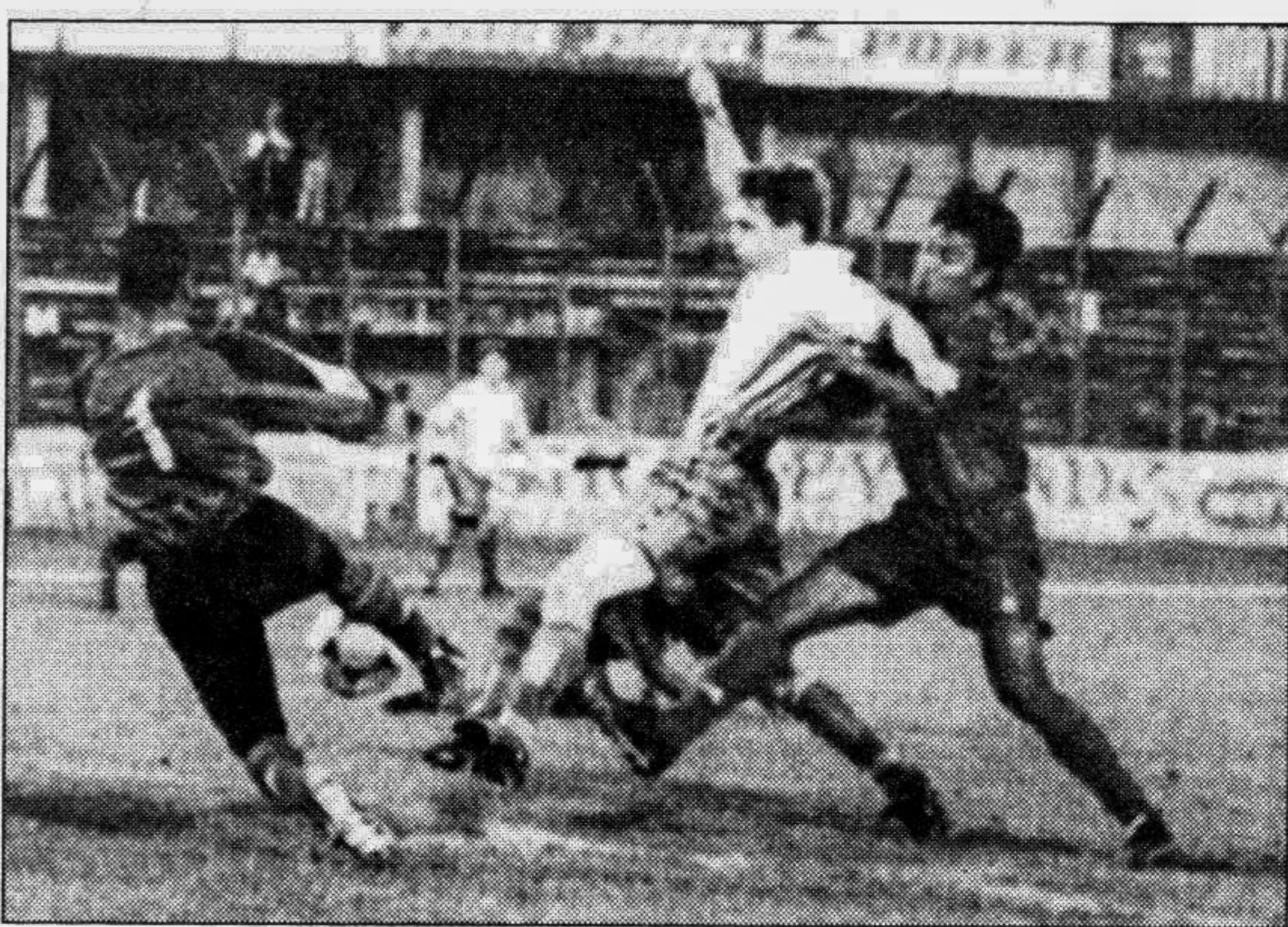
Uzbeks on the attack against Nepal during yesterday's Bangabandhu Cup clash.

Published by the Editor from City Publishing House Ltd., 90 Kakrail, Dhaka-1000 on behalf of Mediaworld Ltd., 52 Motiheel C.A., Dhaka-1000. Editorial, News & Commercial Offices: House No: 11, Road No: 3, Dhanmandi R/A, Dhaka-1205. PABX: 866772-4, Commercial: 866771, Fax No: 88-02-963035, GPO Box No: 3257, Cable: DAILYSTAR, DHAKA. Internet edition address: http://www.dailystarnews.com and Email address: dstar@bangla.net