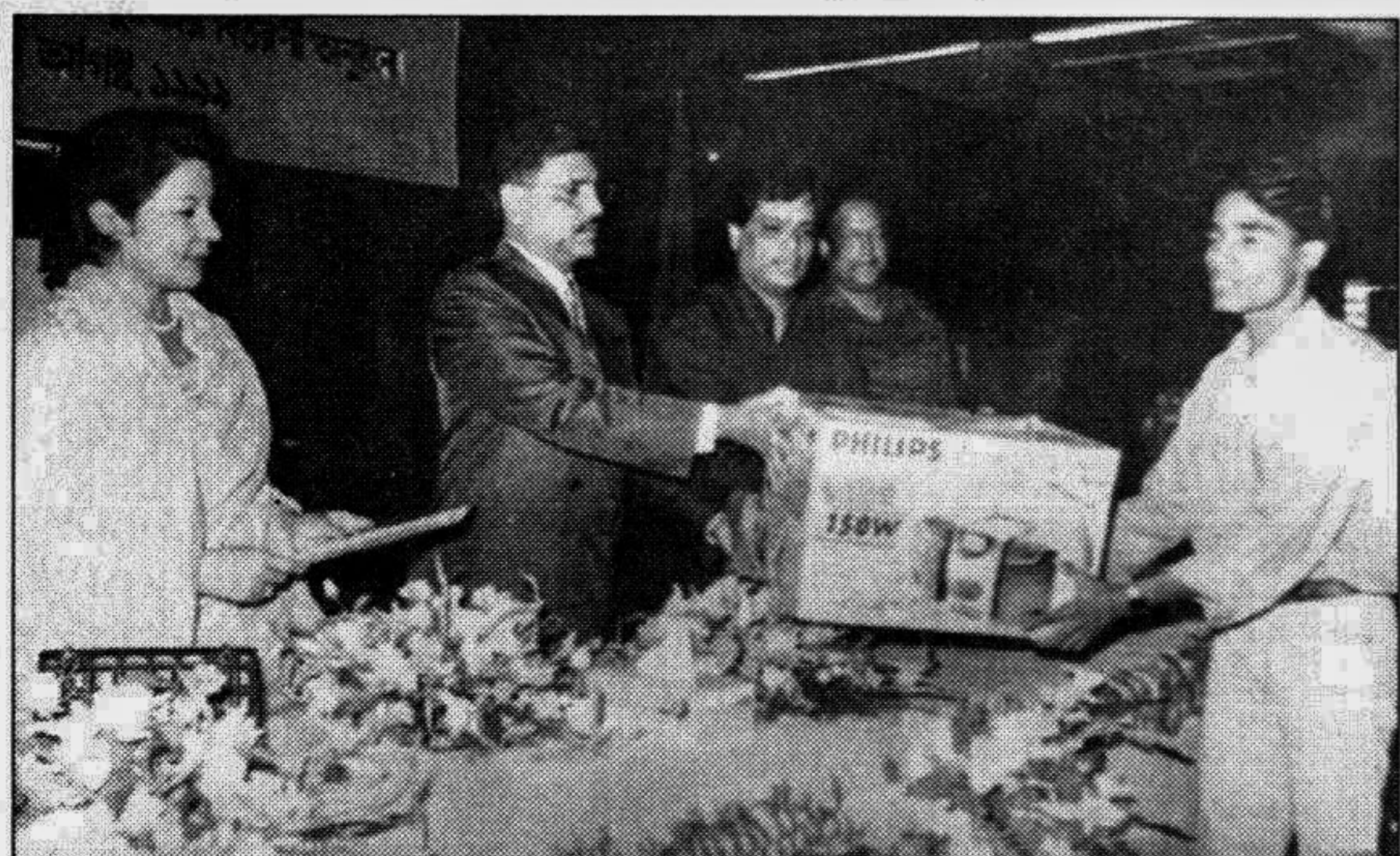
State Minister for Youth and Sports Obaidul Quader handover prizes to one of the winners of Close Up-Kriralok World Cup 1999 quiz contest at the NSC auditorium yesterday.

The final is the fourth of the year for the Swede and he has won the other three. His three titles are second on the ATP Tour to Pete Sampras' four. Since losing in the third round at Wimbledon in July, Norman is 21-4 and his ranking has improved from No 60 to 34th.