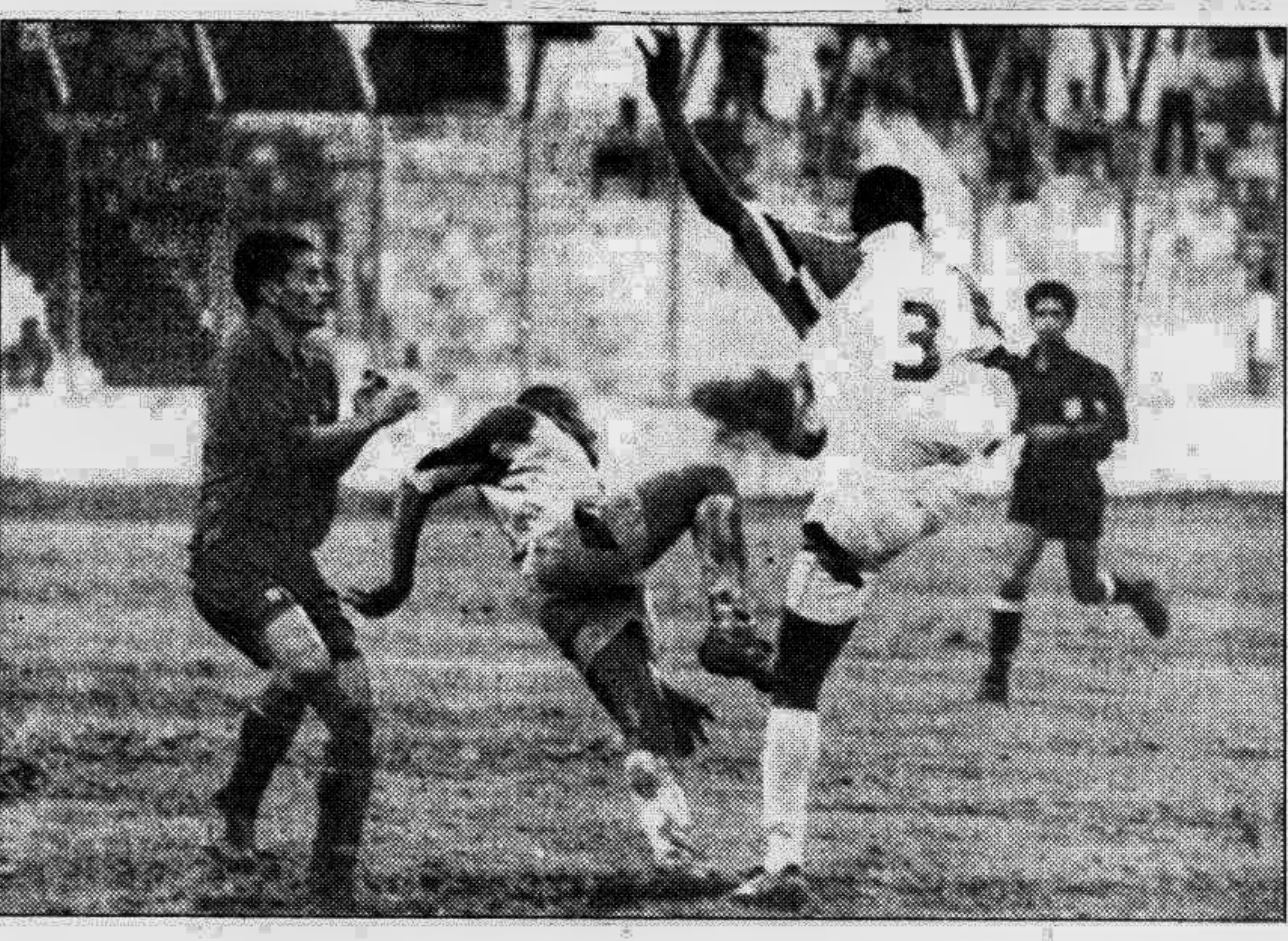
Action from yesterday's Bangabandhu Cup match between Ghana and Nepal.