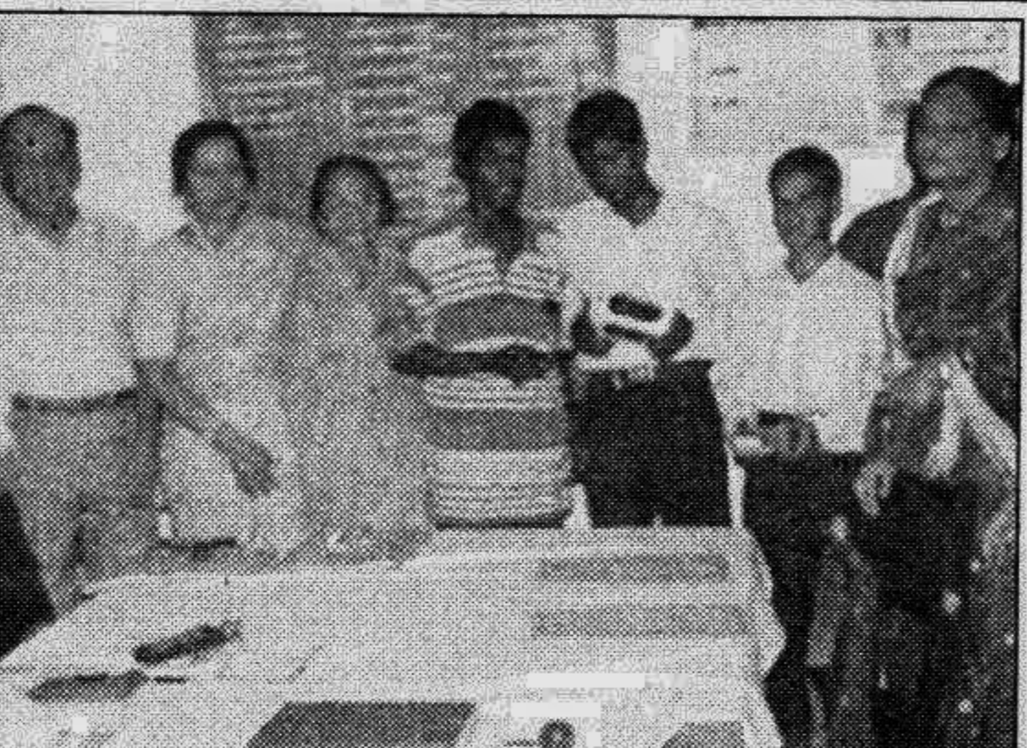
Blind students who passed SSC this year from ABC Sponsored Hostels are seen with the president, general secretary and the other ABC leaders recently.

Bangladesh sent an eight member medical team to Turkey on August 20 to render assistance to the quake-affected people there. The team is reported to be working in Yalova, one of the worst-affected areas, in cooperation with Turkish Red Cross.