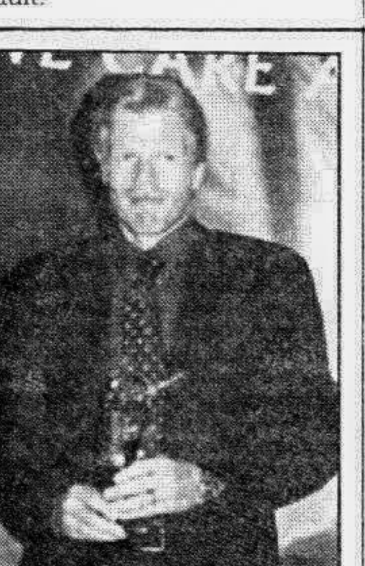
Bayern Munich's German international Oliver Kahn with the European Goalkeeper-of-the-Year Trophy.

Rios, down two break points on his serve in the ninth game of the final set, survived 6-7 (6-8), 6-2, 6-4 in dramatic fashion. Nestor's serve at love with a succession of passing shots followed by the Canadian's double fault.