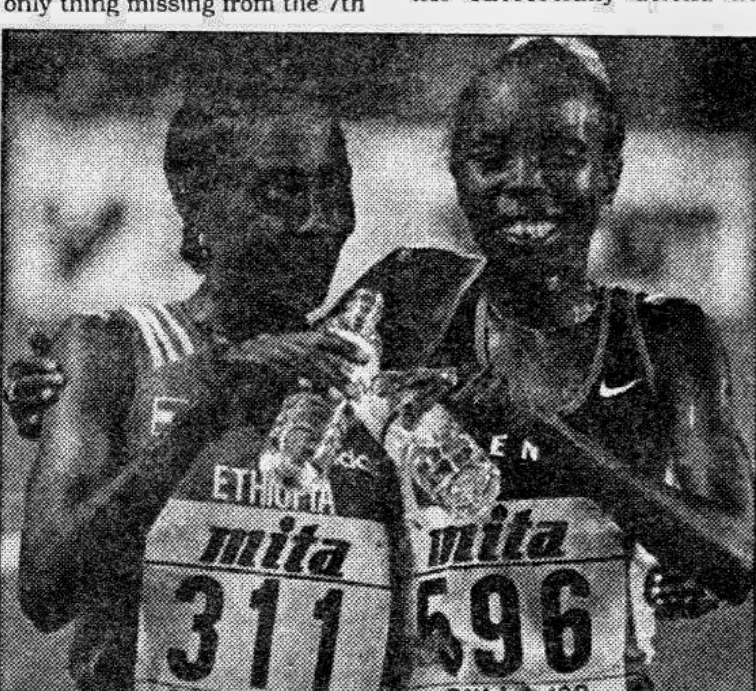
Ethiopian Gete Wami (L) being greeted by Kenyan Tegla Loroupe after the women's 10,000 on August 26. Wami won the gold and Loroupe the bronze.

Britain's Paula Radcliffe took the silver with marathon world record-holder Tegla Loroupe taking the bronze.