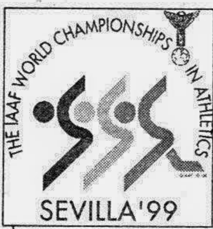
SEVILLE, Spain, Aug 27: Double Olympic champion Michael Johnson delivered the only thing missing from the 7th

It was a desperately needed filip for a championship still reeling from the injury that destroyed Marion Jones' dream of a sprint double.