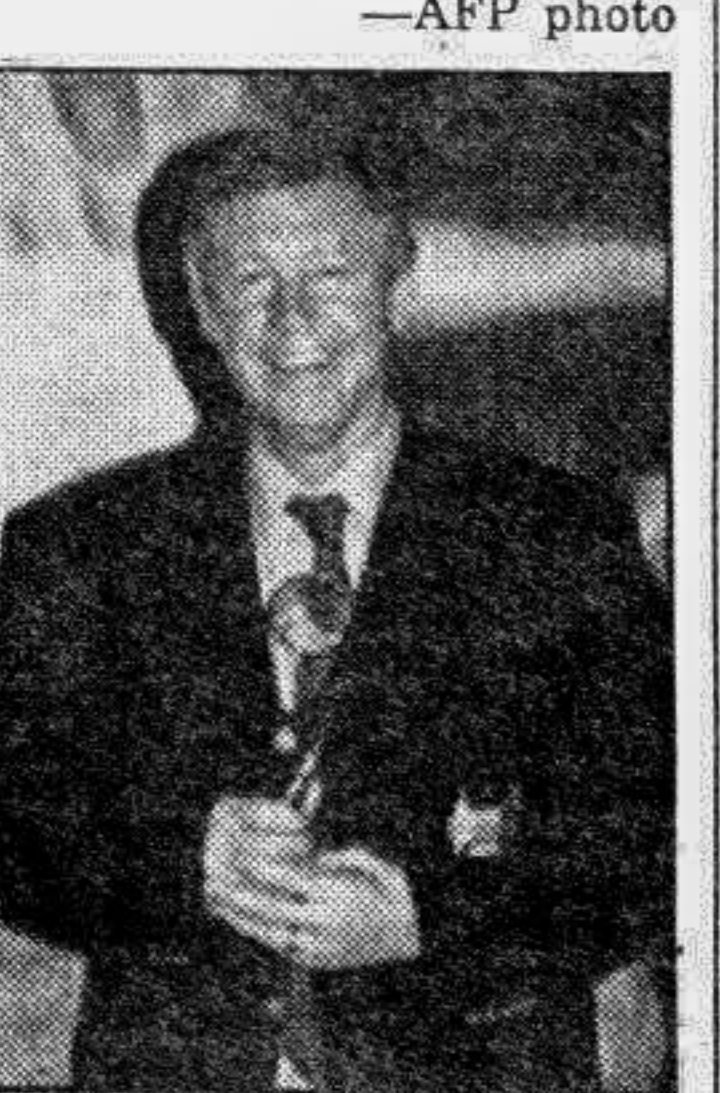
Manchester United's Sir Alex Ferguson with the UEFA Manager-of-the-Year Trophy.