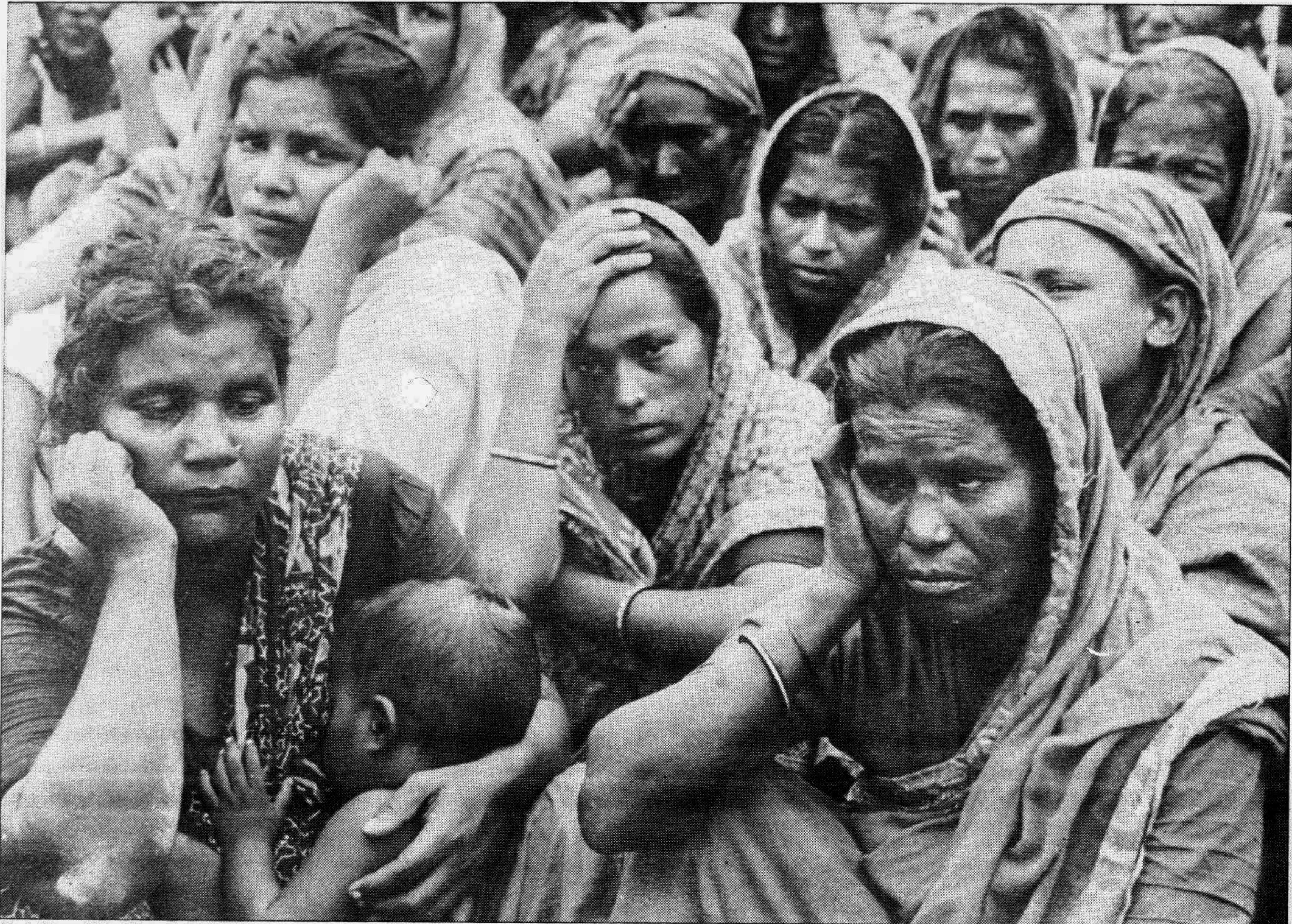
Bleak future: Evicted from where they came, leaving behind the security of "belonging".