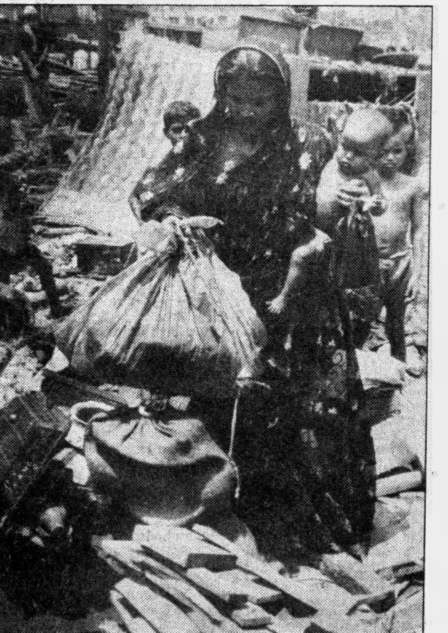
Her shanty is no more there, but from here to where?