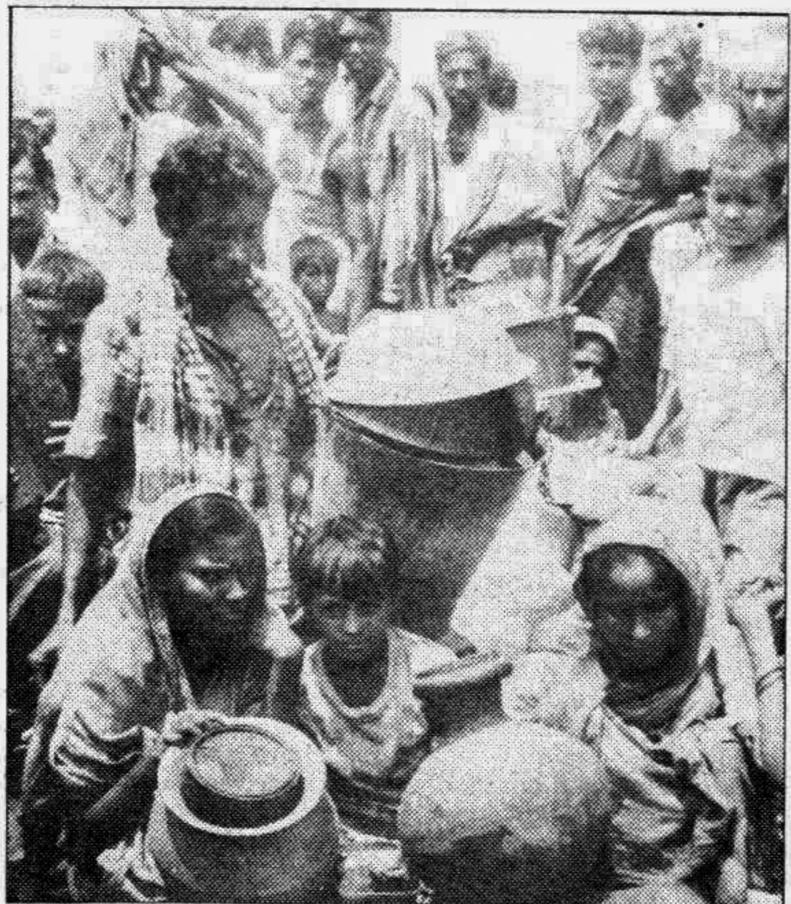
Evicted: And now under the sun and then in the rain, and no protection whatsoever for anyone.