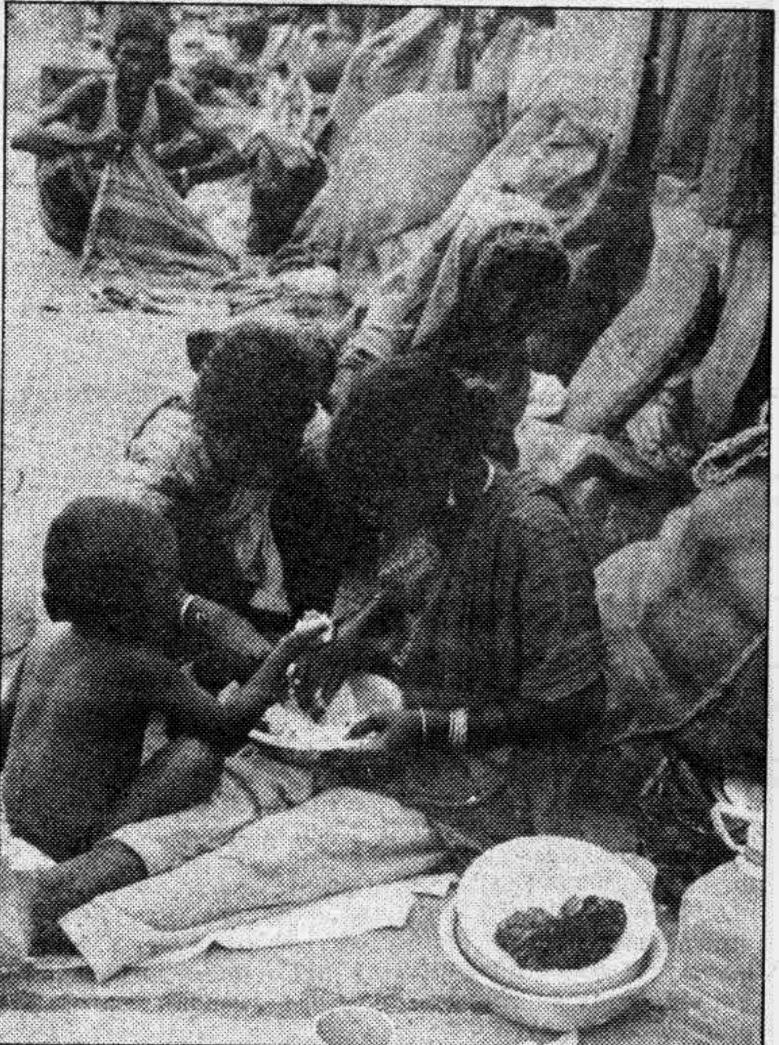
The whole truth: Wherever you are, you cannot do without food, whatever it is if you can make an access to.