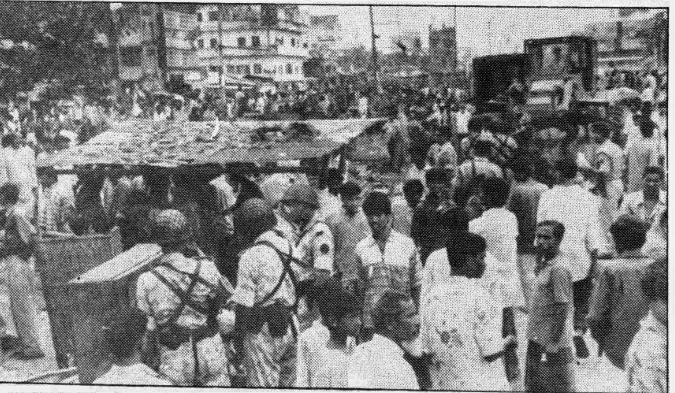
Bastees bulldozed and gone, but where will go the basteebases?