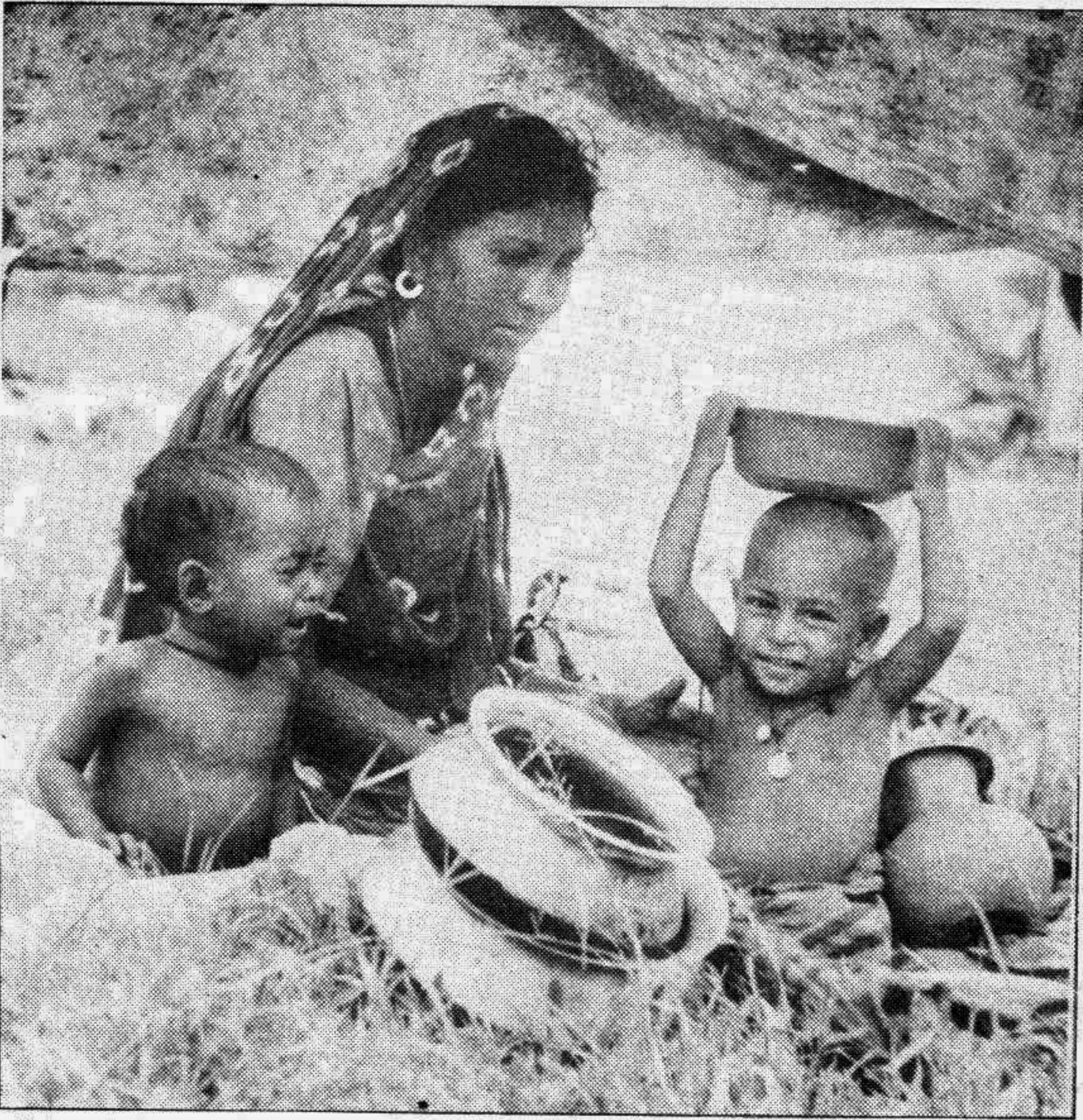
Thrown out: And it's all woes now — what to cook, how to protect children, where to go!