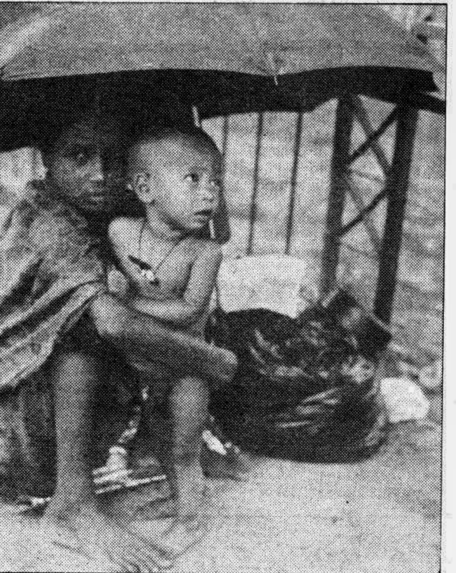
It may be rain, it may be sun she has only the umbrella left to protect her son!