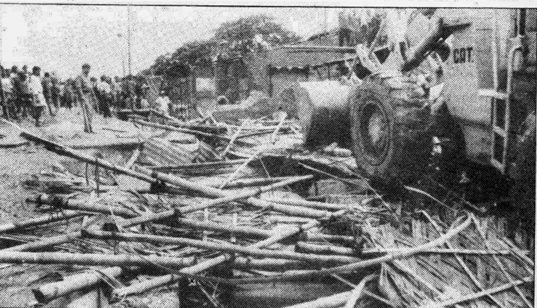
Razed to ground the "breeding ground" of "bad elements"