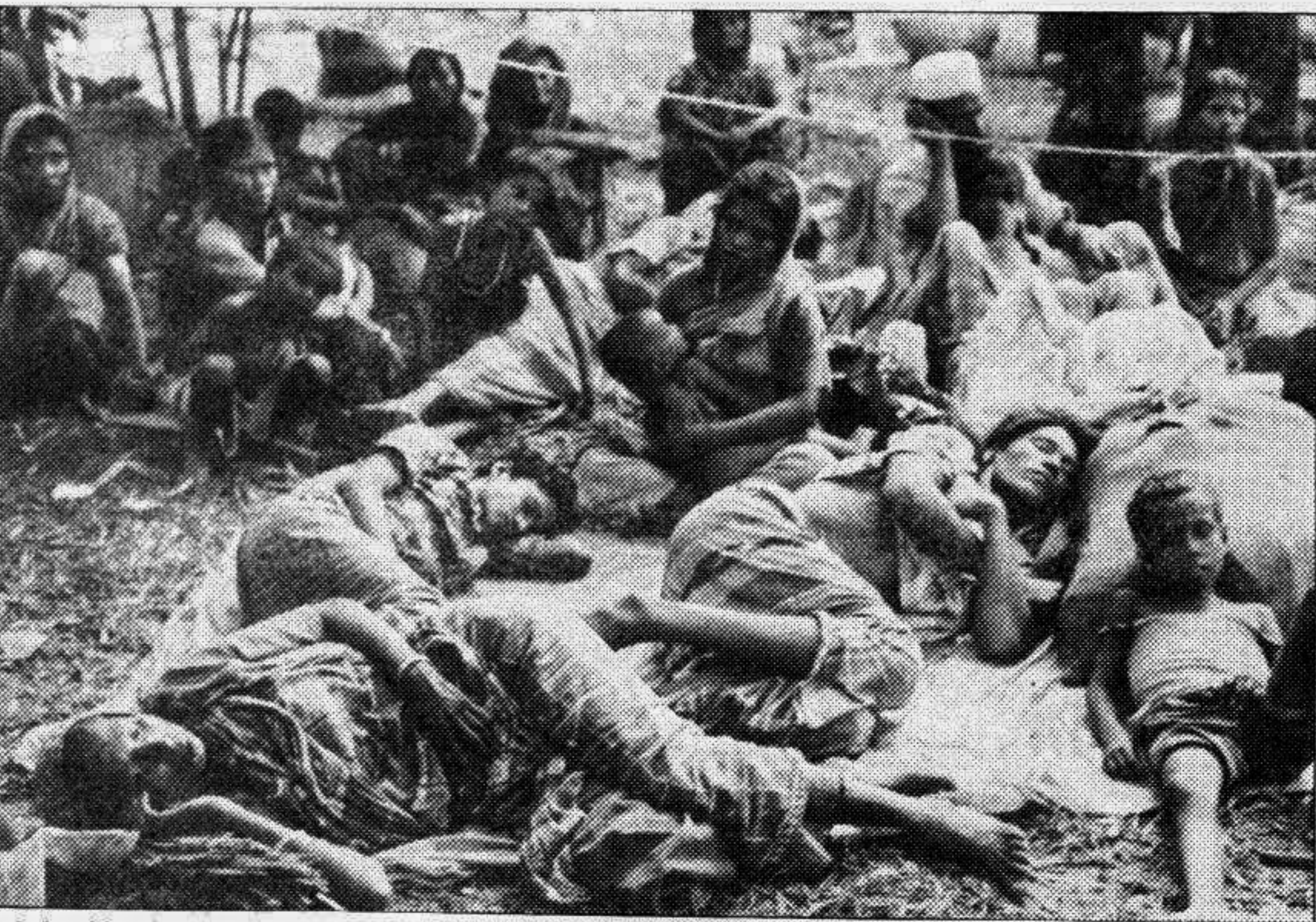
Life's like that: However much the odds of uncertainty and frustration you have to find some respite.