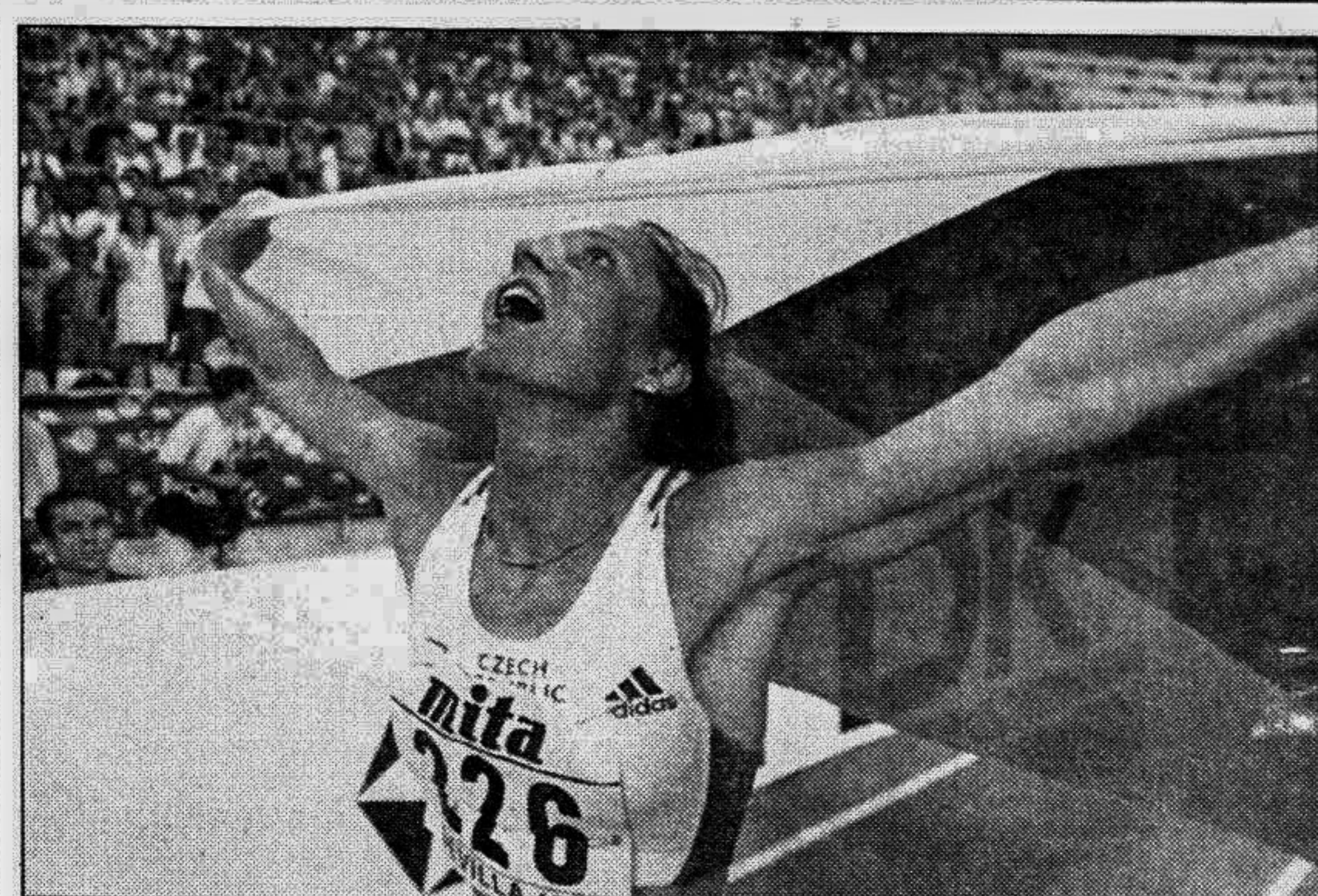
Czech Republic's Ludmila Formanova is euphoric after winning the ladies' 800 metres at the IAAF World Athletics Championships on August 24.

Quote of the Day — "Unbelievable! Can you believe this? To tell you the truth, I have no idea how I did it," Anthony Washington after winning the gold in the discus.