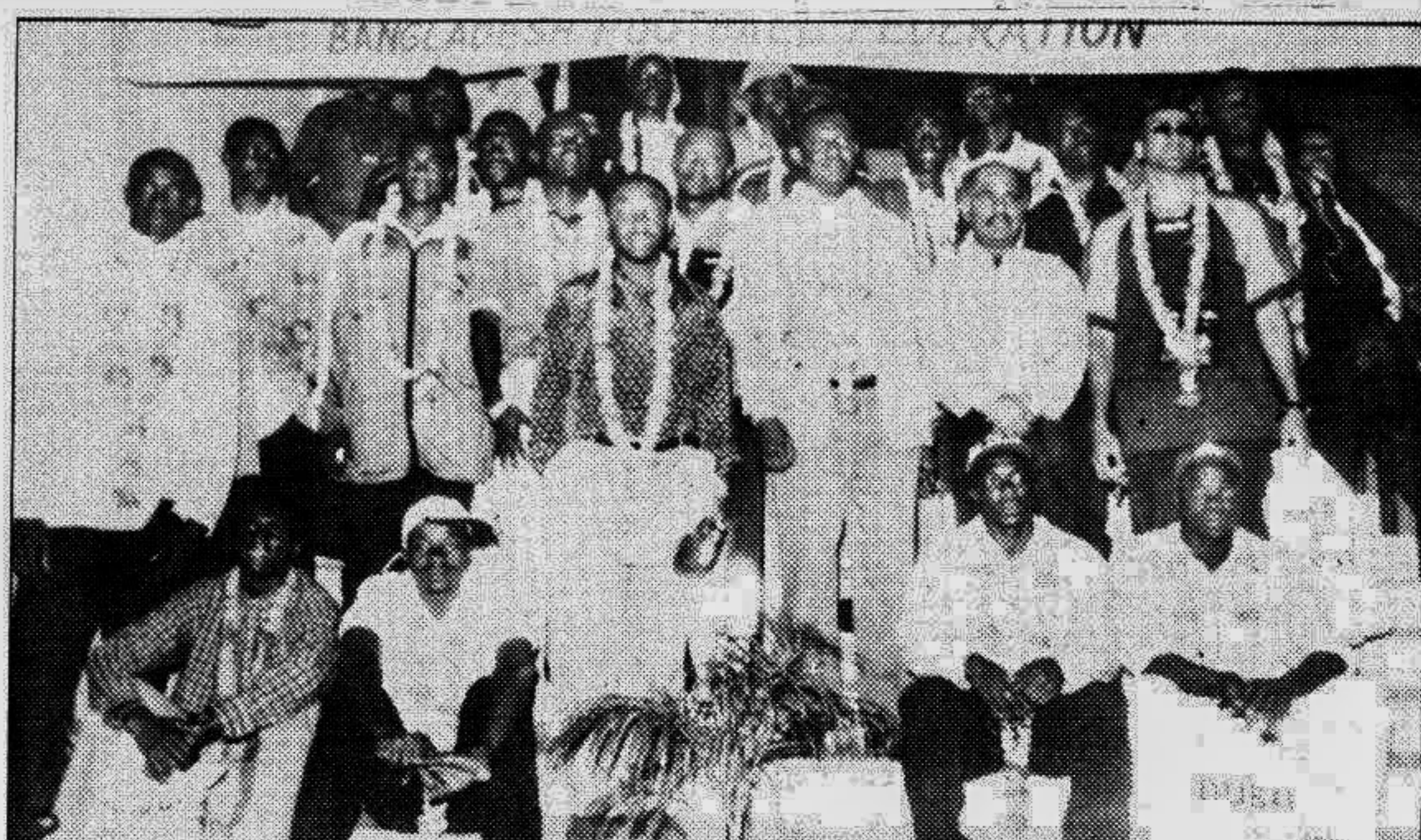
Members of the Ghana Olympic soccer team at the ZIA yesterday afternoon.

Nottinghamshire had also signed on another young Pakis- tani fast bowler Muhammad Zahid for the 1997 season, but he developed back problem af- ter playing just a few matches for them.