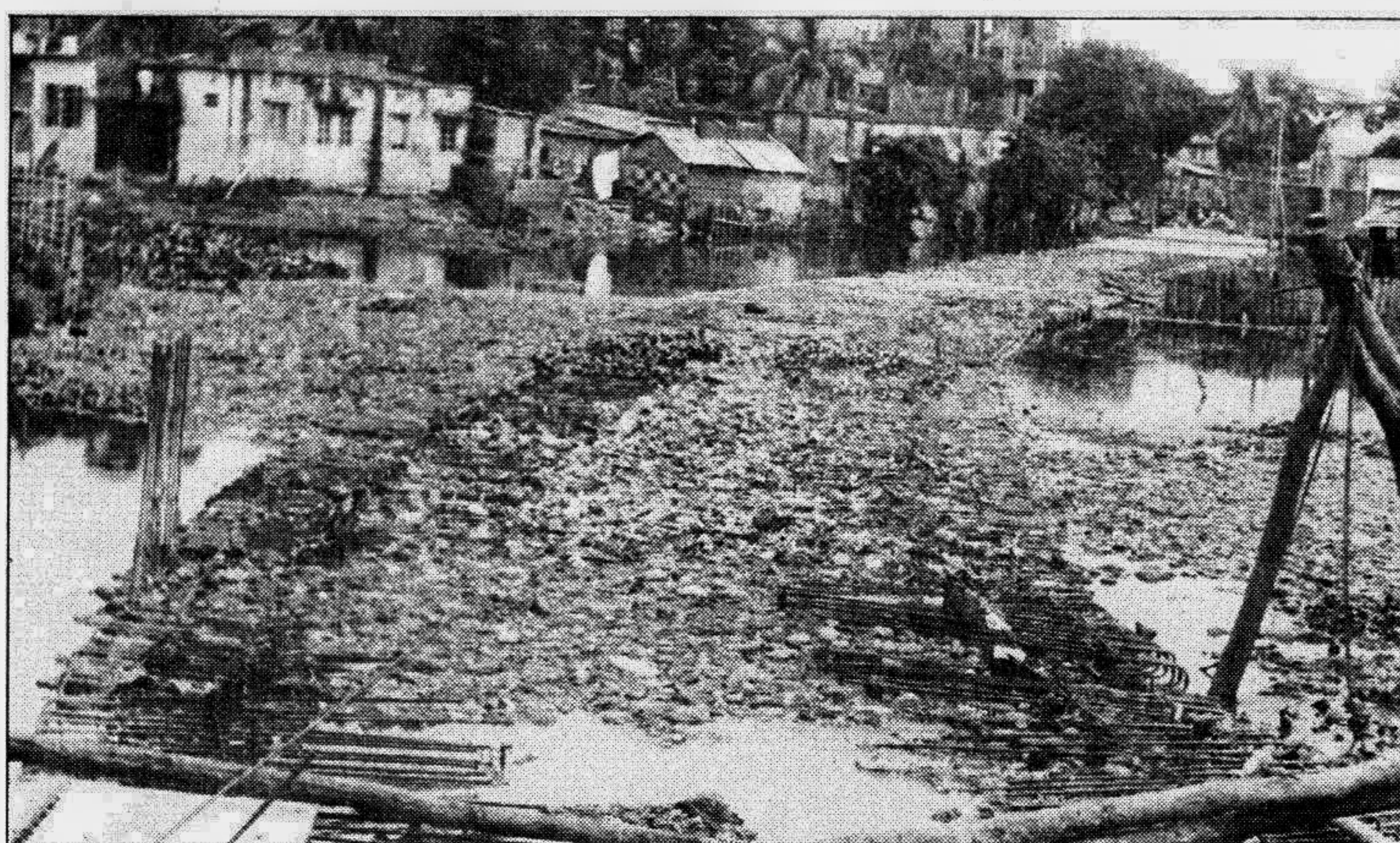
The iron piling to reinforce the concrete in the under-construction box culvert behind Bangladesh Bank is rusting. It is part of Dhaka WASA's storm sewerage project to flush out excess water and save the city from water-logging during the monsoon.

Of the 46 water level measuring stations monitored by the centres, five were flowing above red marks while 23 points recorded rise and 18 fall.