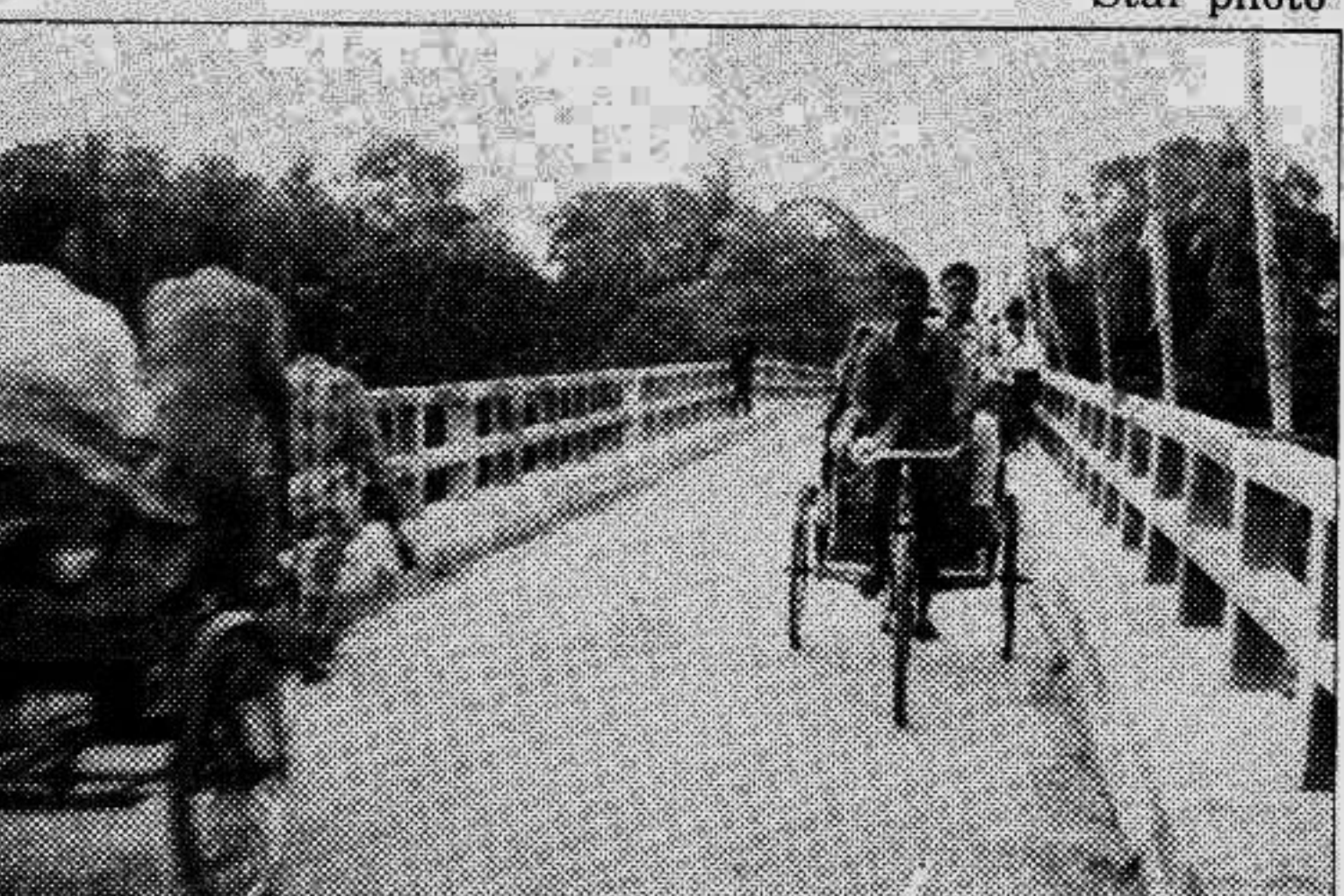
Work on Taka 70 lakh bridge construction project on the River Nabaganga at Arappur in Jhenidah was completed recently.