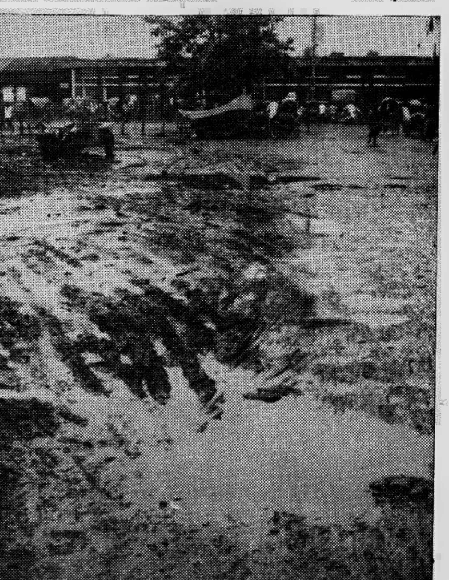
Road or paddy field? Pitiable condition of Mymensingh railway station approach road. But the authorities concerned are indifferent to the sufferings of the railway passengers who use the road very frequently.