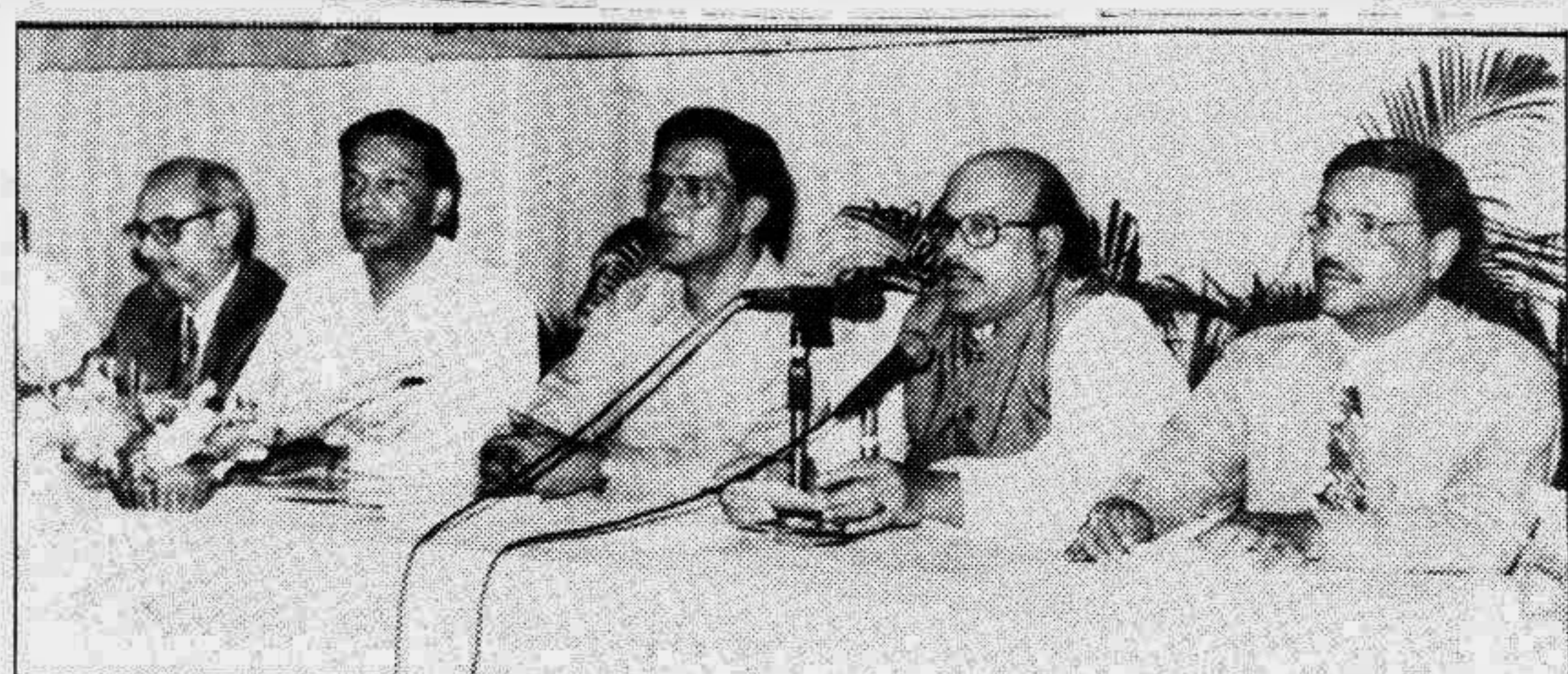
Chairman of the organising committee for Bangabandhu Cup and Home Minister Mohammad Nasim briefing the media at a city hotel yesterday.

LAS VEGAS, Aug 24: Orlin Norris has emerged as the likely comeback opponent for Mike Tyson, whose first fight since getting out of a Maryland prison will take place in late October, reports AP. Sources close to Tyson's camp said Monday Norris is expected to sign this week for a fight that will take place either October 22 or October 23.