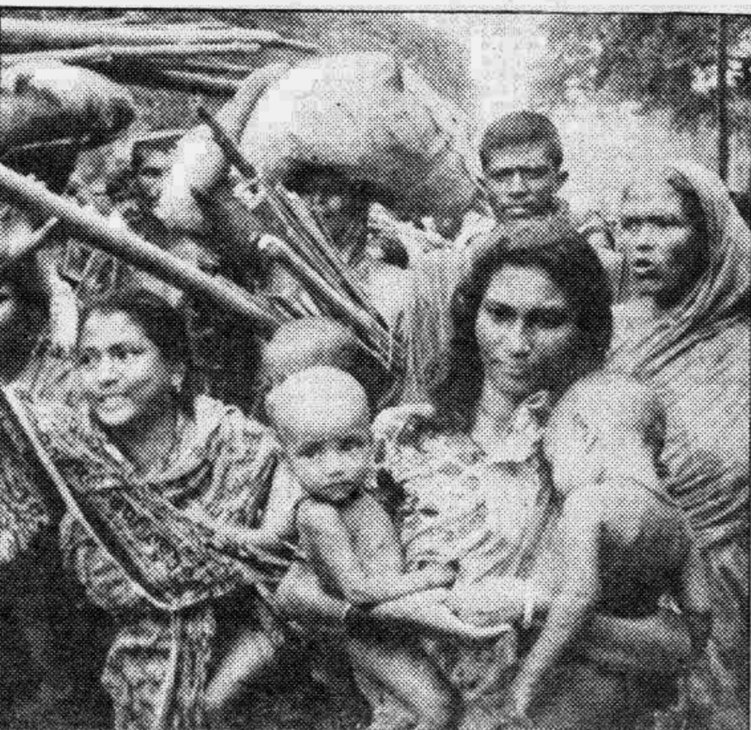
Some of the several thousand squatters leave the Supreme Court premises, their home for six days, yesterday morning.