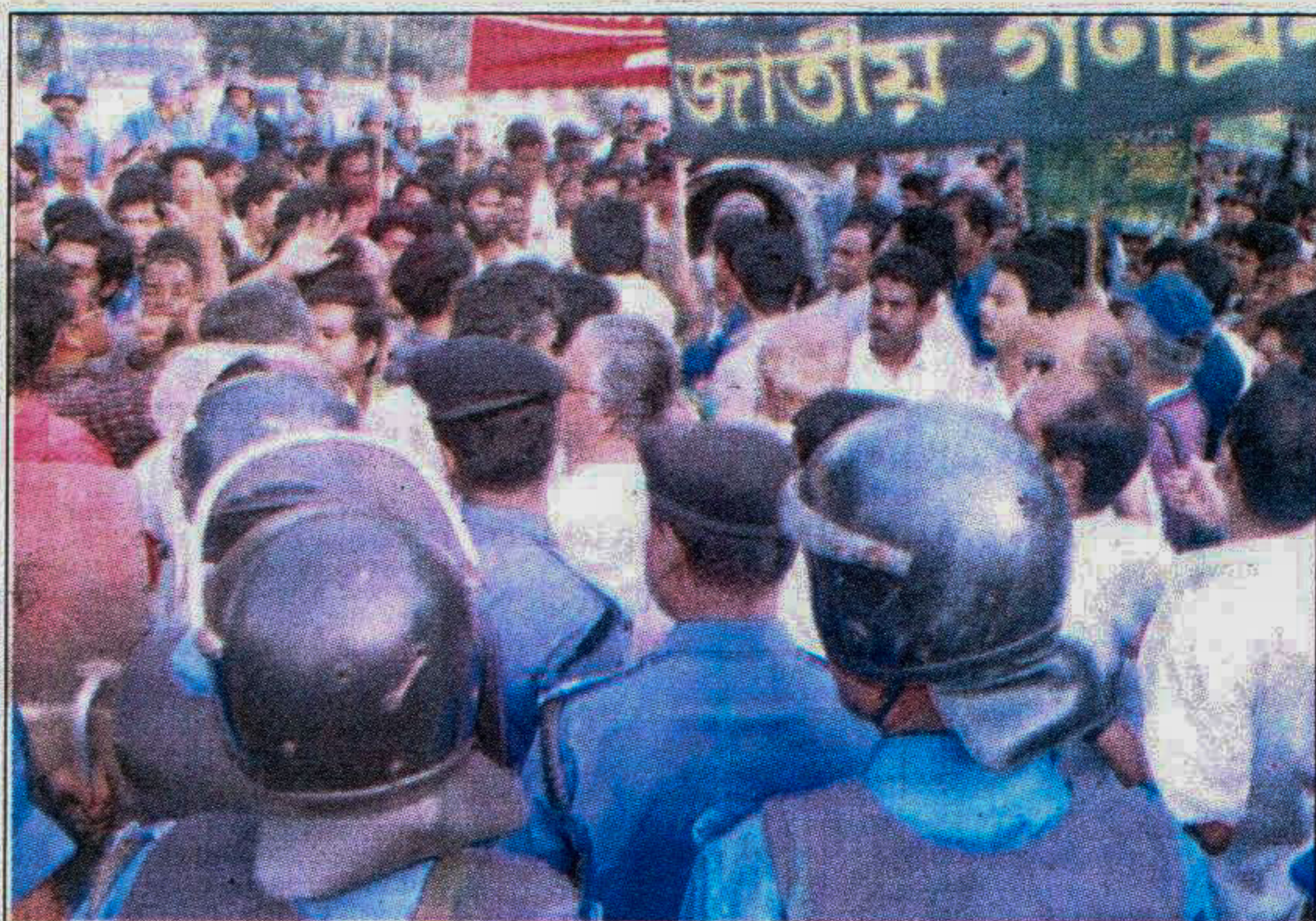
Police at Bangla Motor stop activists campaigning to protect the trees at Osmany Udyan on their way to the Prime Minister's Office yesterday.