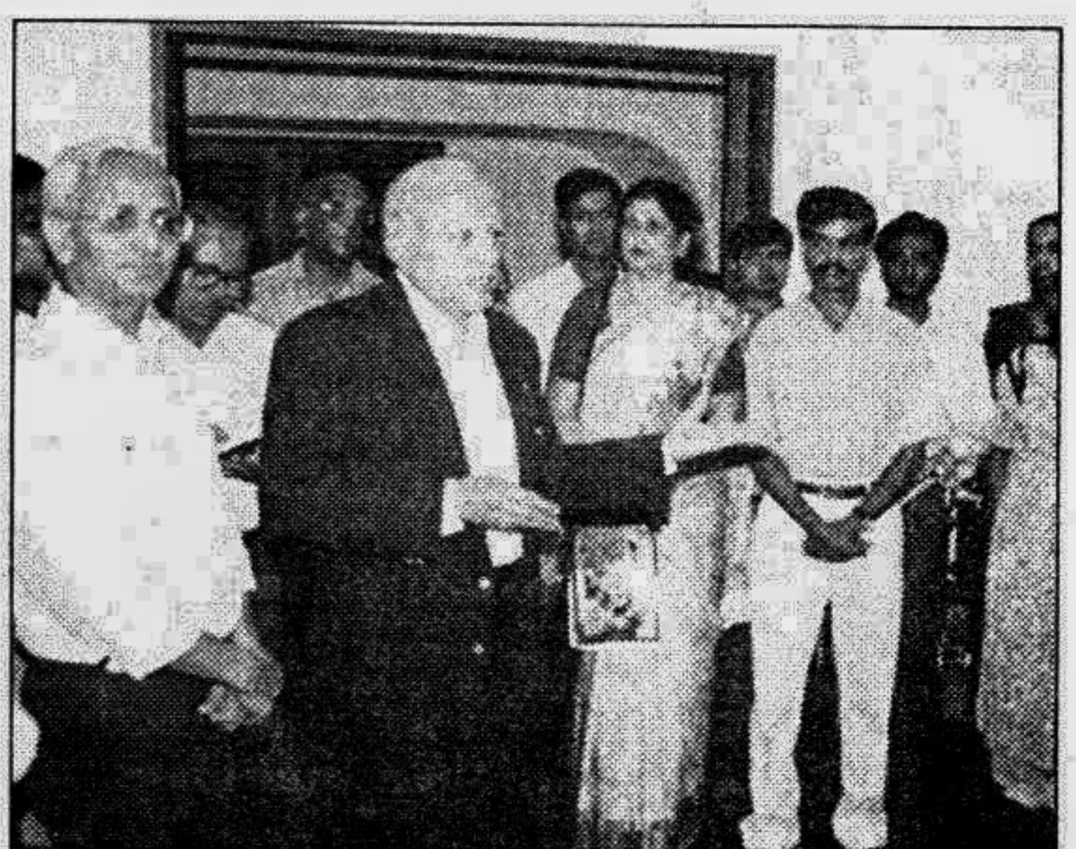
Dr Swaminathan, visiting Indian agriculturist speaking to members of The Hunger Project and its volunteers at a local hotel yesterday.