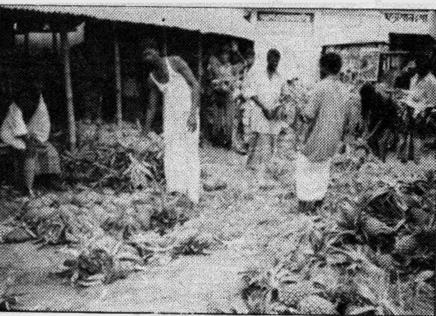
Fruits for life: Pineapples have flooded the bazaars of Magura town in recent days. At present a pair of pineapple is being sold at the rate of Taka 20 at the local Pura Bazaar.

COX'S BAZAR, Aug 23: Acute water crisis has been prevailing in five blocks of Rohingya refugee camp at Nayapara in Teknaf thana for the last few days, reports UNB. Officials and inmates of the camp said the water pump in the camp went out of order resulting in the crisis. However, the authority has been supplying 50,000 litre water against the demand of 3 lakh litre for over 13,000 refugees in the camp.