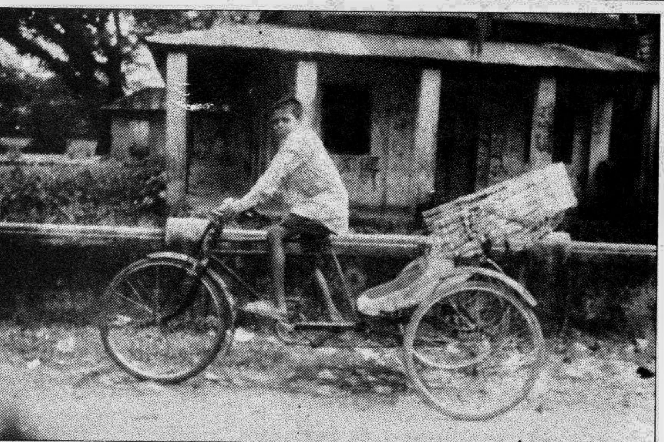
Shameful child labour: Kamrul, a 12-year-old boy, pulling rickshaw.

Now what is urgently necessary is that the higher authorities of both PDB and WDB should jointly work out plans and programmes for the protection of the plant at Aricha and its immediate execution for the greater interest of the country as a whole.