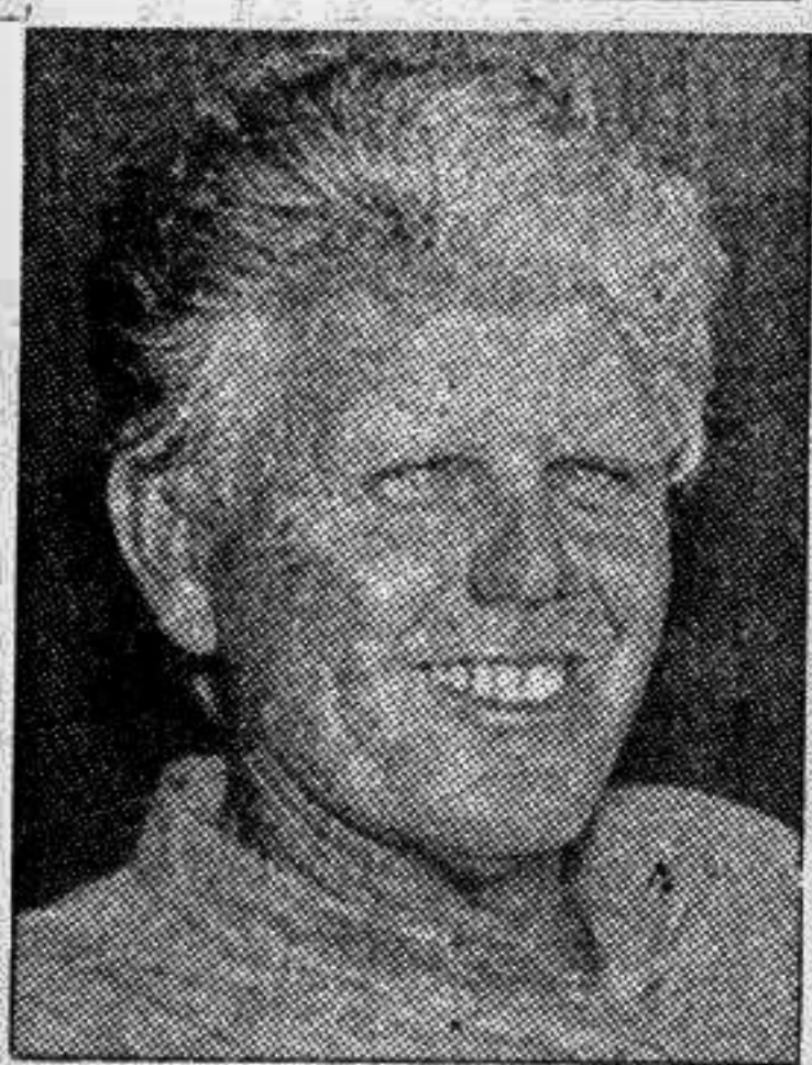
Barry Richards (South African cricketer great) "Discipline is essential for success at the highest level."