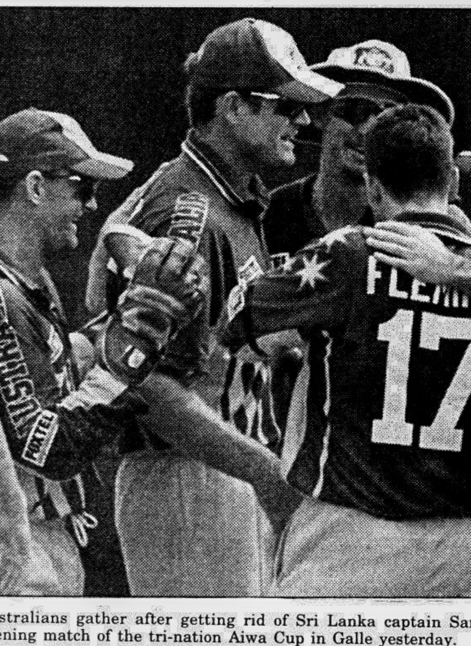
Australians gather after getting rid of Sri Lanka captain Sanath Jayasuriya during the opening match of the tri-nation Awa Cup in Galle yesterday.

Note: Sri Lanka's target revised to 212 off 43 overs.