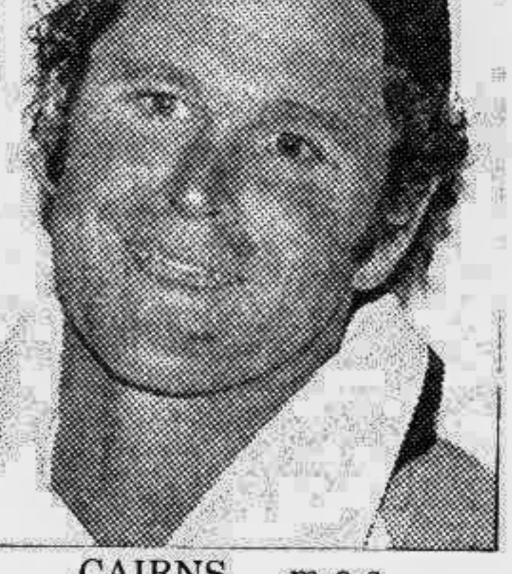
CAIRNS ... m-o-s

It was only New Zealand's second series victory over England following the one in 1986-87.