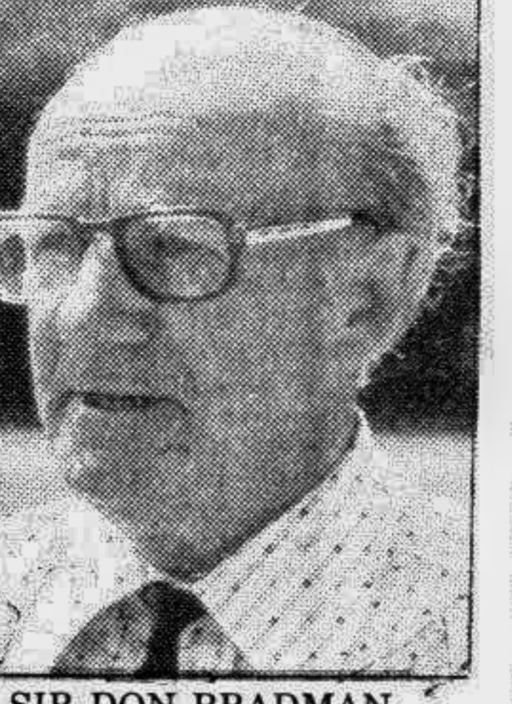
SIR DON BRADMAN

faces of notable Australians such as Bradman, scientist Sir Gustav Nossal and Aboriginal