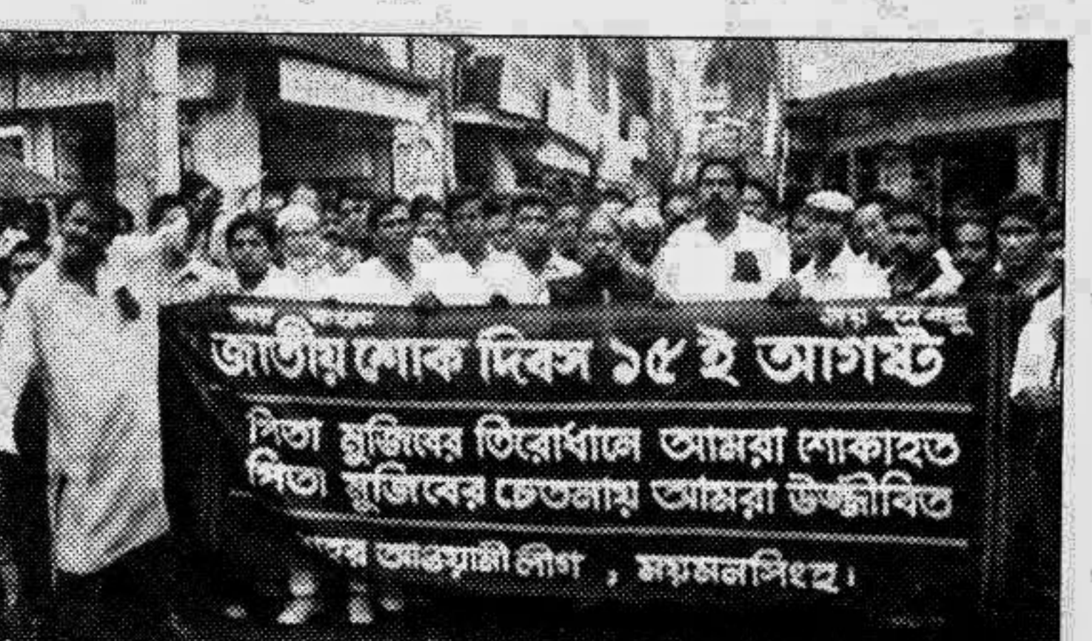
A silent procession was brought out in Mymensingh town by Awami League to mark the National Mourning Day.