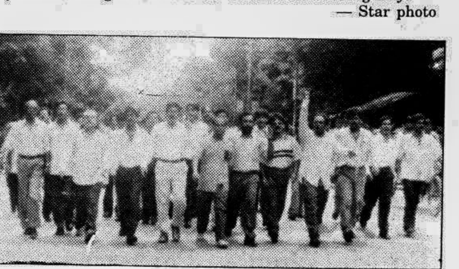
Rangpur District Awami League brought out an anti-terrorist procession in the district town recently to condemn the opposition parties' terrorist acts.