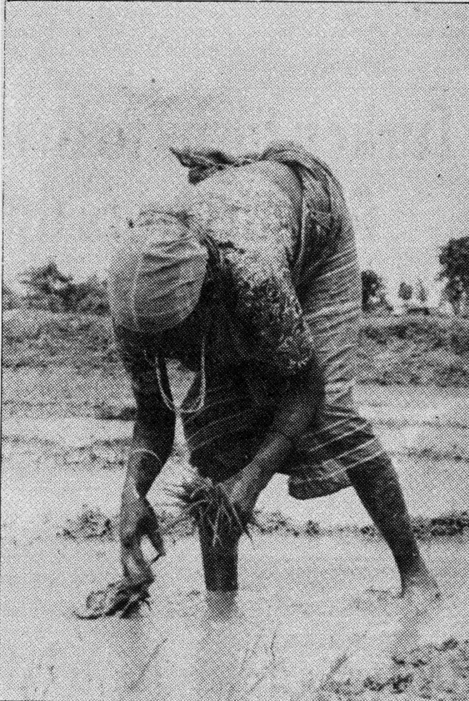
A Santal woman transplanting Aman saplings in a field at Matchpara in Puthia thana.

He suggested tough and effective measures to ensure smooth supply of fertilisers at fixed price everywhere for making Aman cultivation successful.