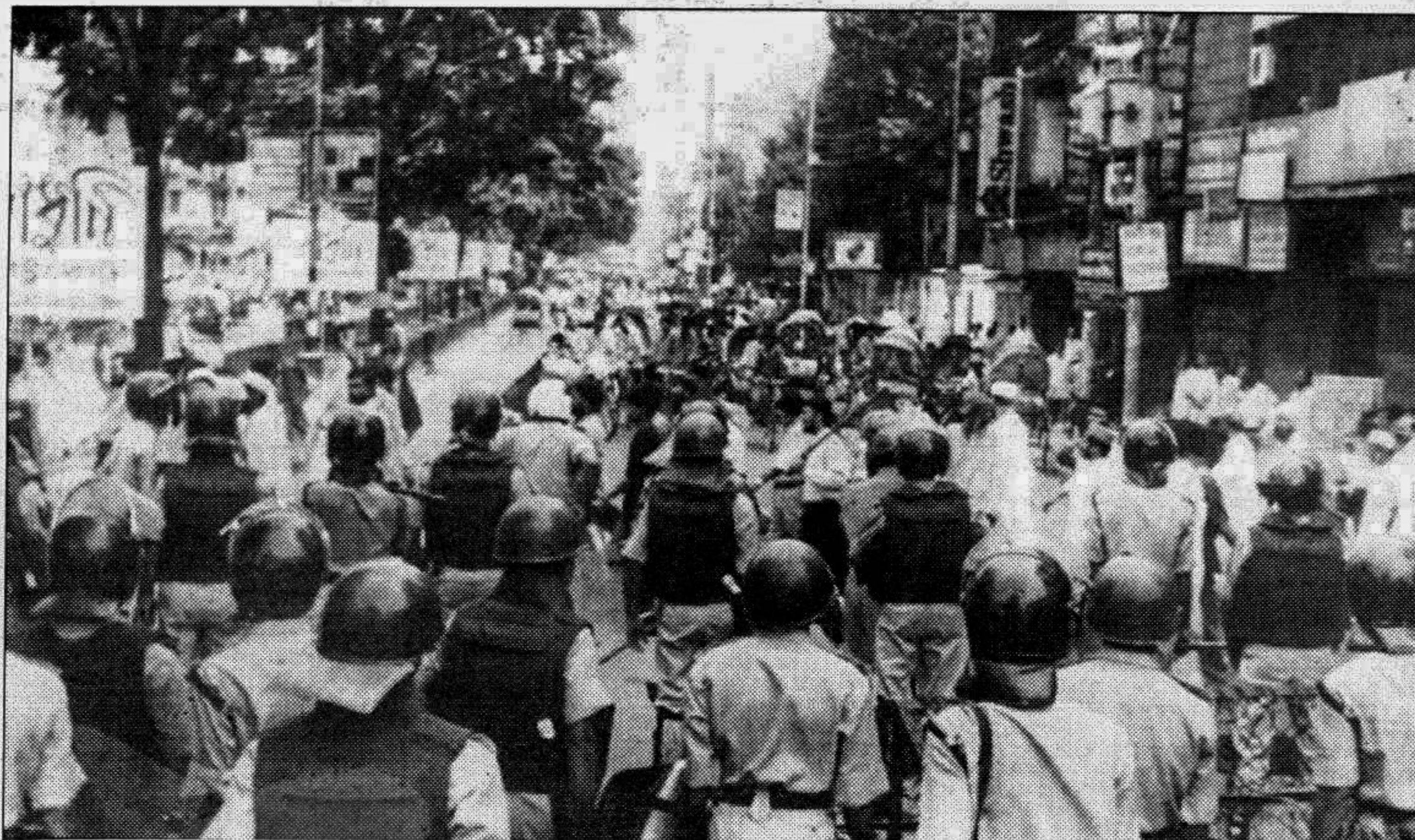
Police put up a barricade on the Purana Paltan highway during hartal hours yesterday to restrict the movement of pro-hartal activists.